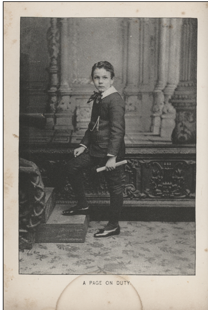
Figure 3. “A Page on Duty,” Among the Lawmakers by Edmund Alton, 1886.

Despite such juvenile musings, this particular Page still thought very highly of his role in the Senate. If there was any doubt that the Senate Pages of the 19 th century took great pride in their role, the chapter entitled “Diminutive Dignitaries” from this book puts that idea to rest. Though the author describes very humble duties—being, literally, at the beck and call of Senators to deliver papers—the pages considered themselves emissaries for the Senators: “My duties threw me among people of all grades and conditions, from the President of the United States to the humblest person in the land; but amid all vicissitudes, I vigilantly endeavored to maintain the dignity of my office as a senatorial ambassador.” 9