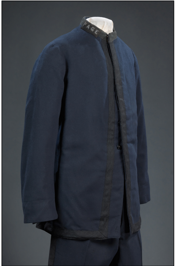
Figure 1. House Page Uniform, c. 1906. Collection of the U.S. House of Representatives, Gift of Todd Lowe, Roger Lowe and Nancy Lowe: Page Uniform Jacket, c. 1906, Collection of the U.S. House of Representatives, Gift of Todd Lowe, Roger Lowe and Nancy Lowe.

This military style sets the Page apart from both the street dress of adolescents and from the men of business that they served.