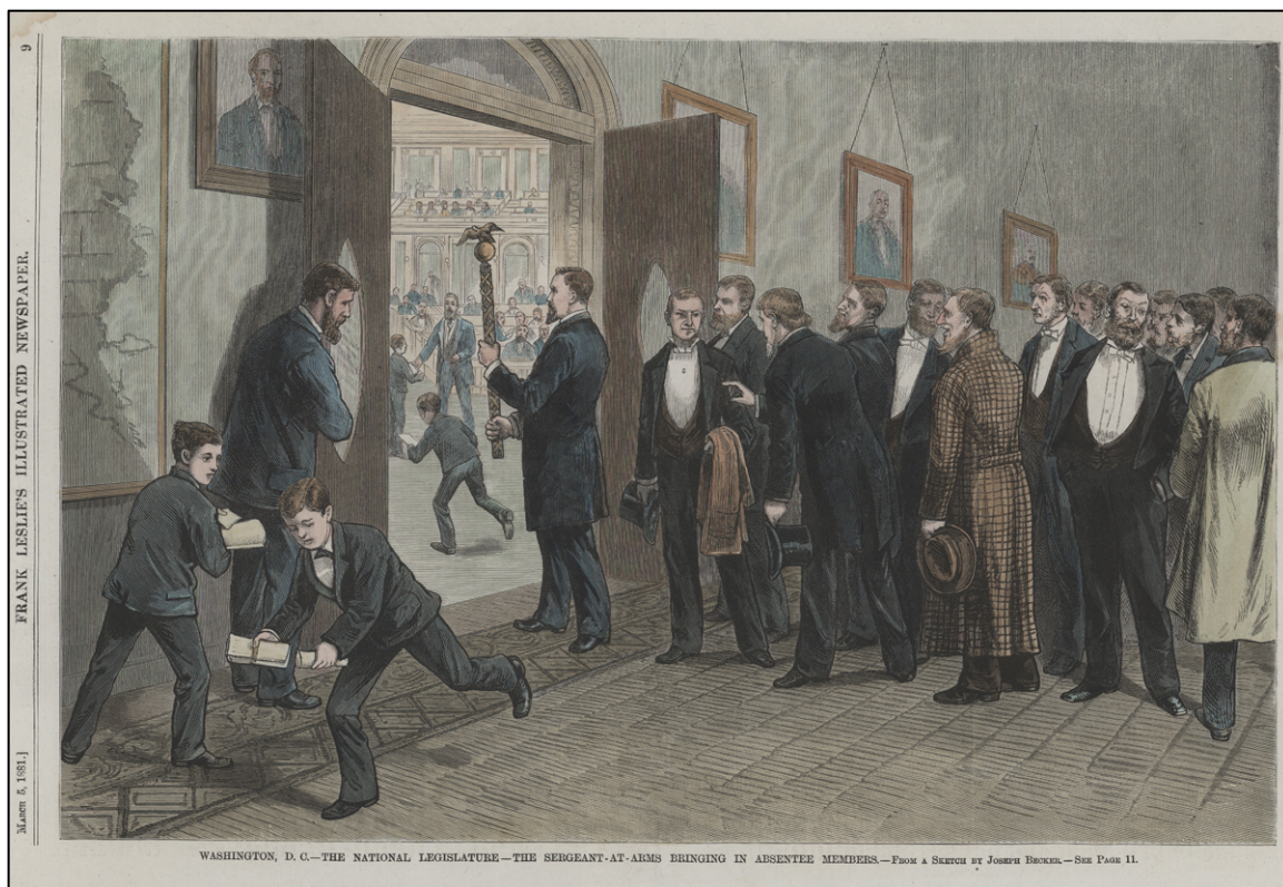
Figure 2. “The National Legislature –The Sergeant-At-Arms Bringing in Absentee Members,” Frank Leslie’s Illustrated Newspaper, 1881

The 1886 book Among the Lawmakers 6 —a combination of a memoir of a Senate page and children’s textbook on government—provides some insight into the Page’s self-image. The frontispiece shows a photographic image of a Senate Page dressed for duty. Like the House pages from the previous print, he is in a dark jacket and bow tie, but, in the Senate tradition, wears knickers and stockings. The Senate continued to require a knicker suit until the 1940s. (Figure 3).