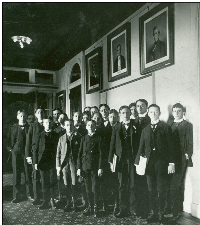
Figure 4. Pages in the Speaker's Lobby, ca. 1912, Image Courtesy of the House Historian.

An undated photo of House Pages in the Speaker's Lobby (figure 4), from around 1912, shows a variety of dress. Smaller boys are more likely to wear knickers, while the larger—and presumably older—boys wear trousers. The ensembles are clearly not standardized—color, jacket and tie style, as well as pant length vary.