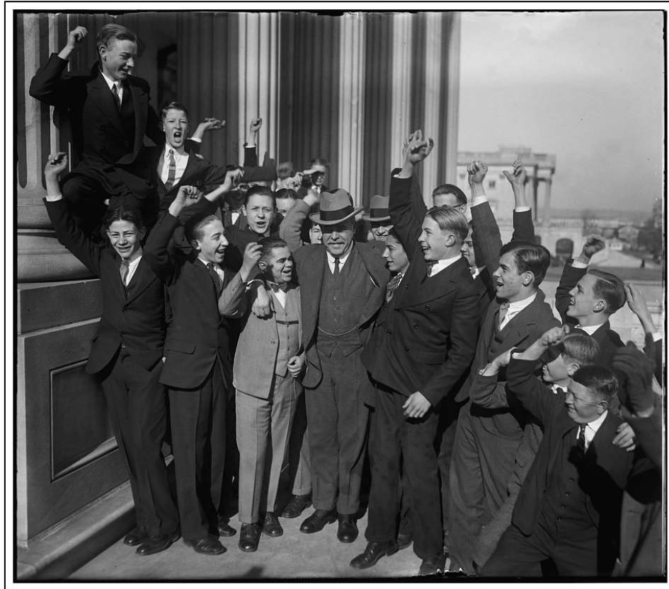
Figure 6. House Pages with Speaker Champ Clark, c. 1915, Library of Congress.

Education. They were offering classes for students aged 12 - 17, explaining that the younger students were being admitted specially during war time. Many of the students were local, and they could remain at the school for up to 6 years. The yearbook also proudly states that none of their former students has been a “failure” and many went on to attend college.