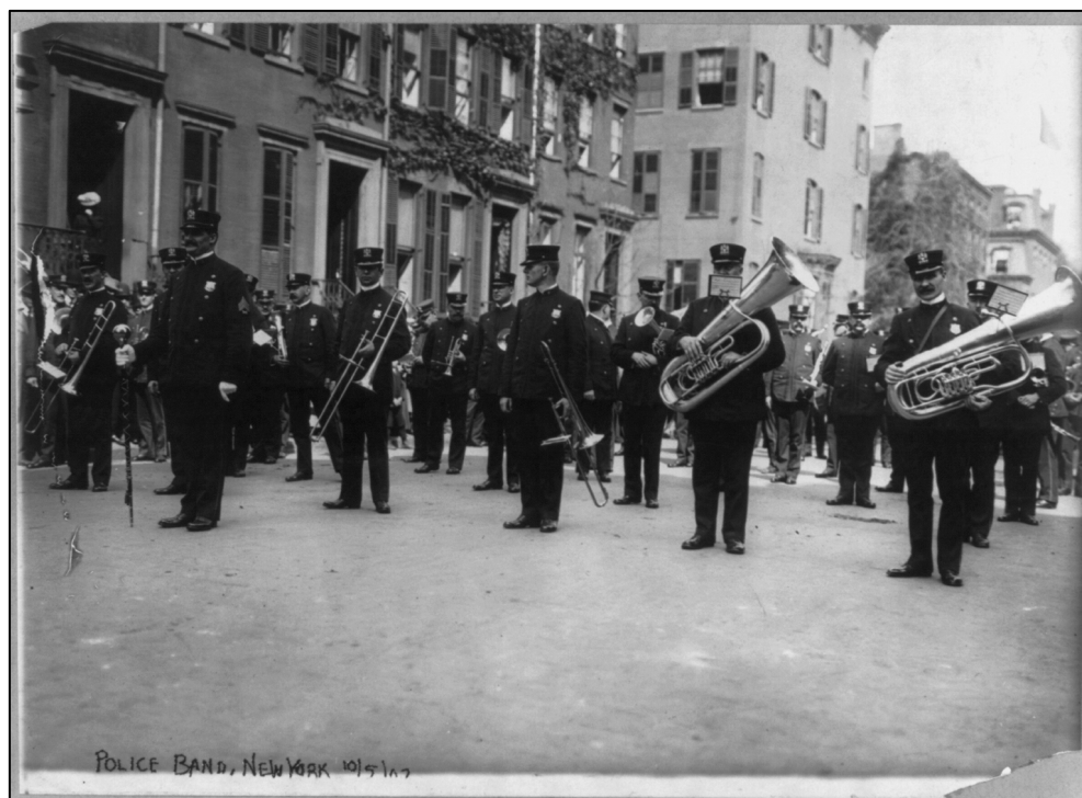
Figure 5. NY Police Department band, c. 1907 Library of Congress; U.S Army (with Teddy Roosevelt), 1901, Library of Congress.

places Mr. Davis and his uniform at the leading edge of the period during which young people were moving towards a place in society that we perceive as modern—in that youth was a time for education and supervision, not necessarily economic productivity—regardless of one’s economic status. It is interesting that at this juncture, a military-inspired look was introduced. Contemporaneous uniforms of a similar style were worn by students, marching bands and the military (figure 5). Perhaps the motivation for dressing the teenage Pages in this manner was to project an air of organization and discipline associated with the style, providing an essence of “uniformity” that was previously absent from the program.