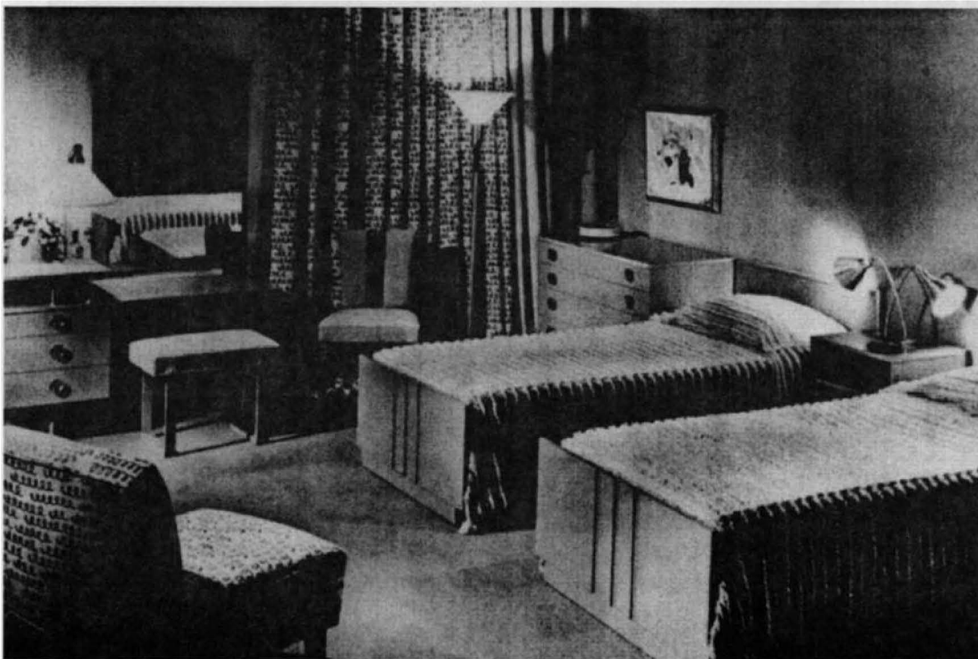
Saarinen Swanson Group Installation with Curlicues , 1947.