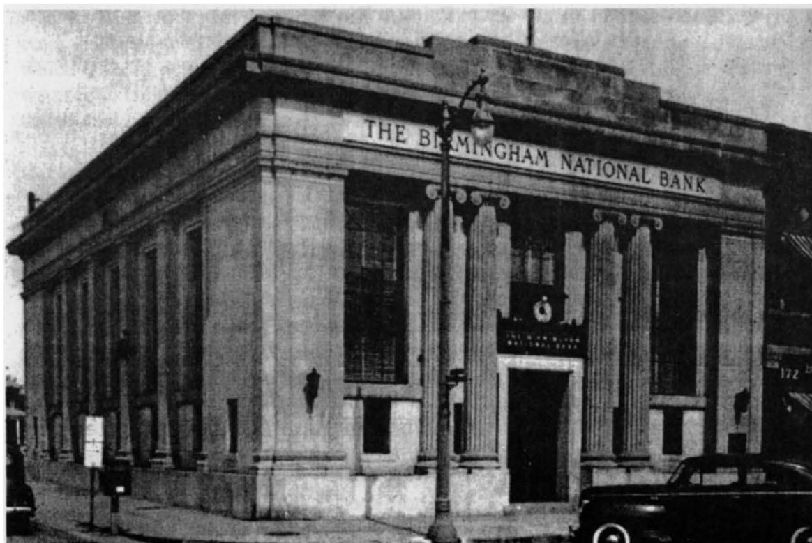
Figure 5. Birmingham National Bank Exterior, 1948.