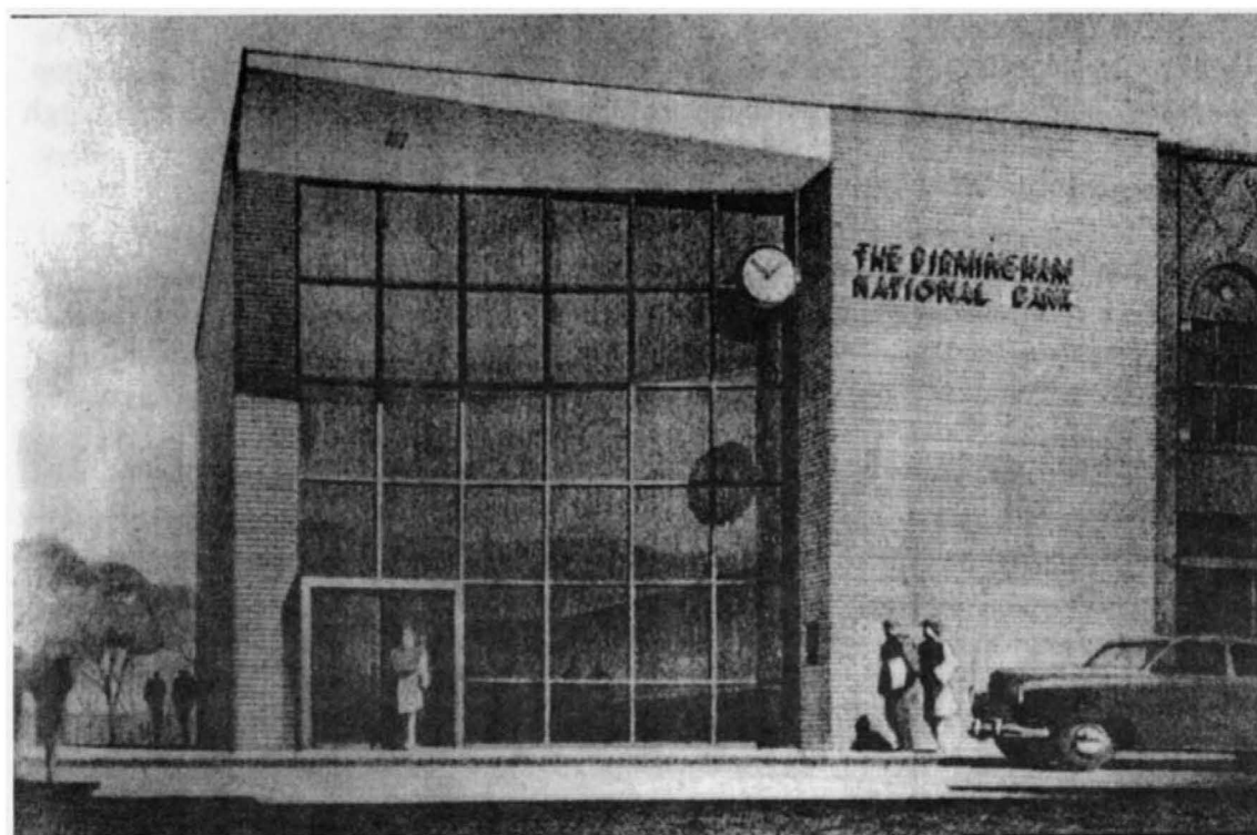
Birmingham National Bank Proposed Exterior, 1948.