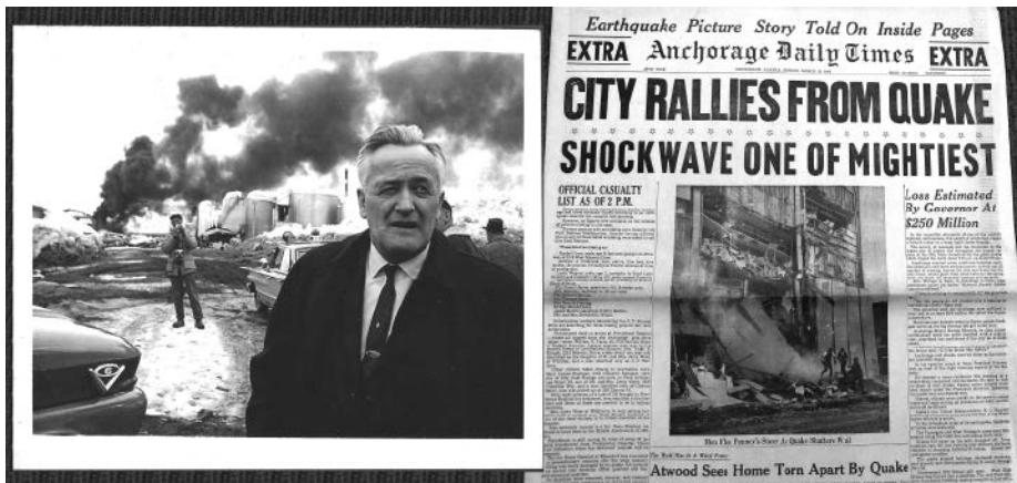
Fig. 2. (left) A photo of Alaska governor William Egan viewing earthquake damage in 1964 in Valdez and (right) front page of the Anchorage Daily Times the day after the 1964 earthquake.

work provided the geologic field evidence that helped to explain where oceanic crust, initially created at mid-ocean ridges, is eventually consumed.