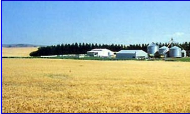
A farmstead windbreak is often a woodland island among large expanses of agricultural crops. (50K JPG)

Local wind conditions affect the amount of energy needed to keep a home comfortable during cold winter months. Unprotected buildings, buildings with poorly fitted doors and windows or frequently opened doors, and buildings in areas with high average wind speeds coupled with low average temperatures are left vulnerable to winter's extremes. Windbreaks reduce