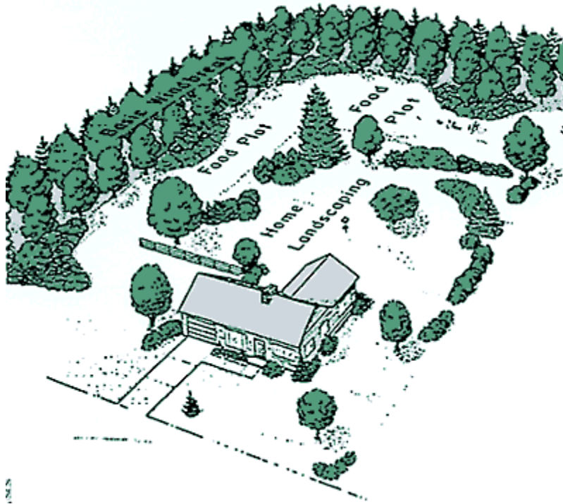
Figure 1. Planting food plots or fruit-bearing shrubs on the lee side of windbreaks provides food in an area protected from wind and possibly warmed by the sun, points that are particularly important in cold months.

The quality of a windbreak for protection from weather extremes relates to several factors, including the wildlife species involved; severity of the weather; age, size (length and width), density, orientation, location, and vegetation composition of the windbreak; and food availability in or near the shelter. Animals in colder climates may require larger, especially wider, plantings.