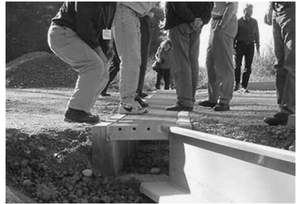
Fig. 1. Amphibian tunnel for mitigating road mortality (Federal Highway Administration, 2002).

Pipe culverts are relatively small structures (0.3–2 m diameter) made of concrete, smooth steel, or corrugated metal designed to carry water under roads. Europe has led the way in implementing smaller pipe-style culverts, also referred to as “amphibian tunnels” (Forman et al., 2003; Fig. 1). Box culverts, generally larger than pipe culverts, also are used to allow water to pass under roads. Unlike pipe culverts, they usually remain dry except in periods of heavy runoff. Culverts may be used by a variety of wildlife species to cross roads (Yanes et al., 1995; Rodriguez et al., 1996; Clevenger and Waltho, 2000). Kaye et al. (2005) reported that spotted turtles ( Clemmys guttata , a state threatened species) used a box culvert under a highway improvement project to move between two habitats in MA, United States. The use of a system consisting of a retaining well, box culverts, and pipe culverts reduced wildlife road mortality by 93.5% in the Paynes Prairie State Preserve, FL, United States (Dodd et al., 2004). Clevenger et al. (2001) monitored 36 culverts along the Trans-Canada highway and found a total of 618 crossings by a minimum of 9 species, with an average of 2.8 species at each culvert. In Australia, Taylor and Goldingay (2004) recorded 17 different vertebrate species