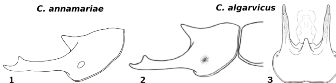
Figure 1–3. Male pronota. 1) lateral view of C. annamariae after Byk (2012). 2) lateral view and 3) dorsal view of Chelotrupes algarvicus after Hillert et al. (2012).

Importantly, the same series of specimens from the type locality (Portugal, Lagos, Vila do Bispo, 7.xii.2006, leg. T. Gazurek) was used in both descriptions: holotype and twenty paratypes of C. annamariae and five paratypes of C. algarvicus , discrediting the validity of the former.