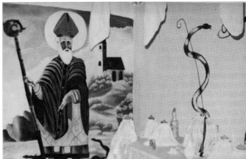
Fig.2. Image of Danbala Wedo as represented by the image of St. Patrick on the wall of a Vodou temple in Carrefour - du-Fort, Haiti

To the Haitian Vodouisants, the image of St. James Major, whom they call Sen Jak, symbolizes the head figure of the group of warrior lwa known as Ogou. (Fig.1) In Dahomey and western Nigeria, Ogun is the patron of warriors, iron smiths and other metal workers. The symbols in the image of St. James Major which have come to represent Ogou