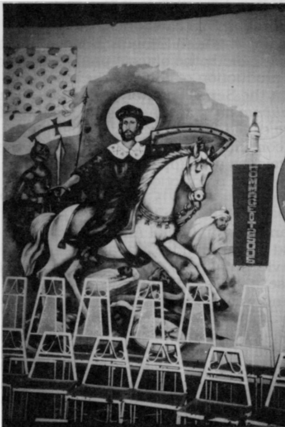
Fig. 1. Image of St. James Major representing Sen Jak, on the wall of a Vodou temple in Port-au-Prince.

These religious elements made their voyage to the New World by way of the brutal migration of the slave trade. Forced onto the sugar plantations of San Domingue, the slaves sought to reassemble their traditional beliefs and methods of worship.