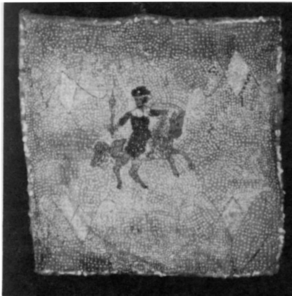
Fig. 4. Vodou flag for Ogou, circa 1940. Note the image of St. James who represents Ogou. The early iconography is monochromatic in appearance.

The early drapo show the images of the lwa in subtle polychrome sequins on background fabric of appropriate colors. (Fig.4) The images from this period appear delicate, and not as well defined as the later drapo. The images are executed in the style of " simen grenn " which translates to "scattering seeds", in which the sequins are used sparingly, and great amounts of background fabric is unadorned. Robert Farris Thompson believes that the pattern of dotting that this type of sequin design produces is related to the Kongo concept of ritual dotting as a mediation of the secrets and power of the dead. 7