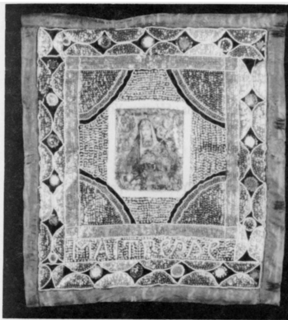
Fig.8. Vodou drapo for Ezili Freda, circa 1970. By this time the paper image of Mater Dolorosa is being used in the center field, and the borders are fairly sophisticated.

Simple borders had become popular by the early 1960's, but the borders themselves, as well as the central field remained sprinkled with sequins in the " semin grenn " style. By this time the muslin fabric backing the fancy outer fabric had been replaced by burlap. This was a heavier material, but it enabled the sequins to begin to be used in greater numbers without concern for sagging.