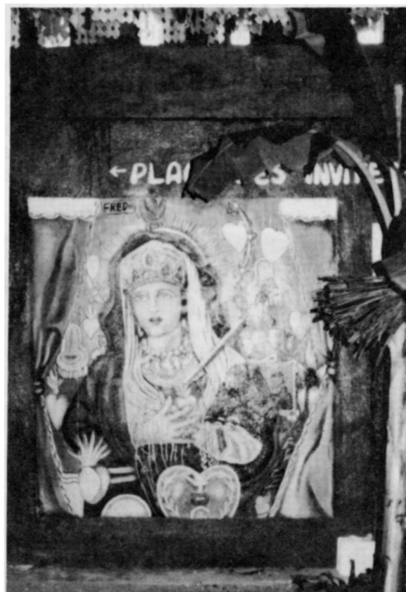
Fig.3. Ezili Freda Dahomey as represented by Mater Dolorosa on the wall of a Vodou temple in Martissant, Haiti.

The drapo have undergone a metamorphoses throughout their history. Unfortunately, there are virtually no drapo remaining which existed prior to the late 1930's, due in part to Haiti's hot, humid climate, but primarily due to several anti superstition campaigns waged by the Catholic church in which almost all Vodou artifacts were destroyed. Although there is written documentation of drapo being used in Vodou ceremonies during the colonial period, visual documentation dates only to the early