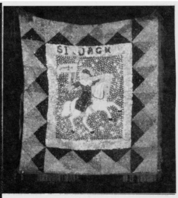
Fig. 9. Vodou drapo for St.Jak/Ogou, circa 1980. By this time the attention to multiple borders is well established, and the drapo is fully covered with sequins.

By the late 1960's and early 1970's burlap was used regularly to back the satin and velvet face fabric. (Fig.8) Sequins had become more plentiful in Haiti due to the presence of American owned companies which had their garment piecework assembly done at Haitian factories. By this time the attention to borders and imagery of the symbols had become sophisticated. The colors reflected not only those appropriate to the lwa , but the borders had become very important, possibly a reflection of the "op art" and graphic textile designs so popular in the United States and Europe at the time. (Fig.9) Although the heavy burlap