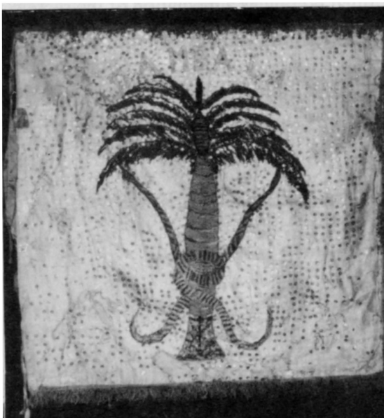
Fig. 5. Vodou drapo for Danbala Wedo, circa 1940. The snake representing Danbala is entwined with his wife Aida Wedo around the palm tree which represents Aizan.

The oungan then begins his invocation to the lwa . As he sings, a choir of initiates, called houns begin to accompany him, clapping their hands in unison.