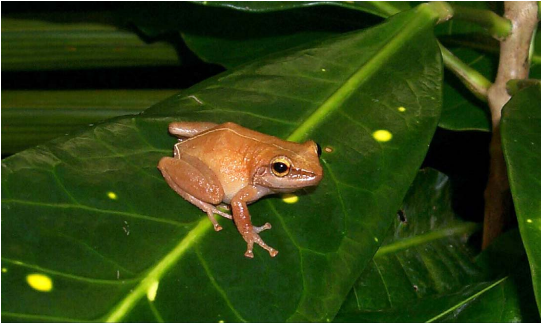
FIGURE 4. Photograph of Eleutherodactylus coqui on a leaf that has been treated with citric acid and is showing phytotoxic effects.

from October 2001 to September 2002 and was only used for registration and testing; it was never used operationally. Hydrated lime was legal for use from April 2005 to April 2008. Homeowners preferred hydrated lime over citric acid because of its lower cost of application (~$0.02/liter). However, hydrated lime persists as a white residue of calcium oxide on plants for several weeks, which is not a desirable feature in floriculture. At the time of writing, both caffeine and hydrated lime are no longer registered for use to control frogs.