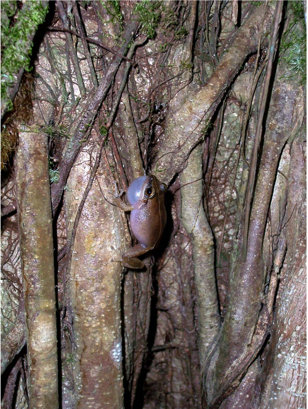
FIGURE 2. Photograph of calling male taken in Hawai'i.