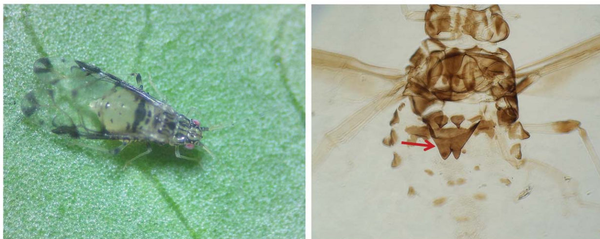
Figure 1. Adult female of Sarucallis kahawaluokalani (Kirkaldy). A. Alate female in life. Palmira, Colombia. B. Slide-mounted alate female. Notice large bifid tubercle (see arrow).