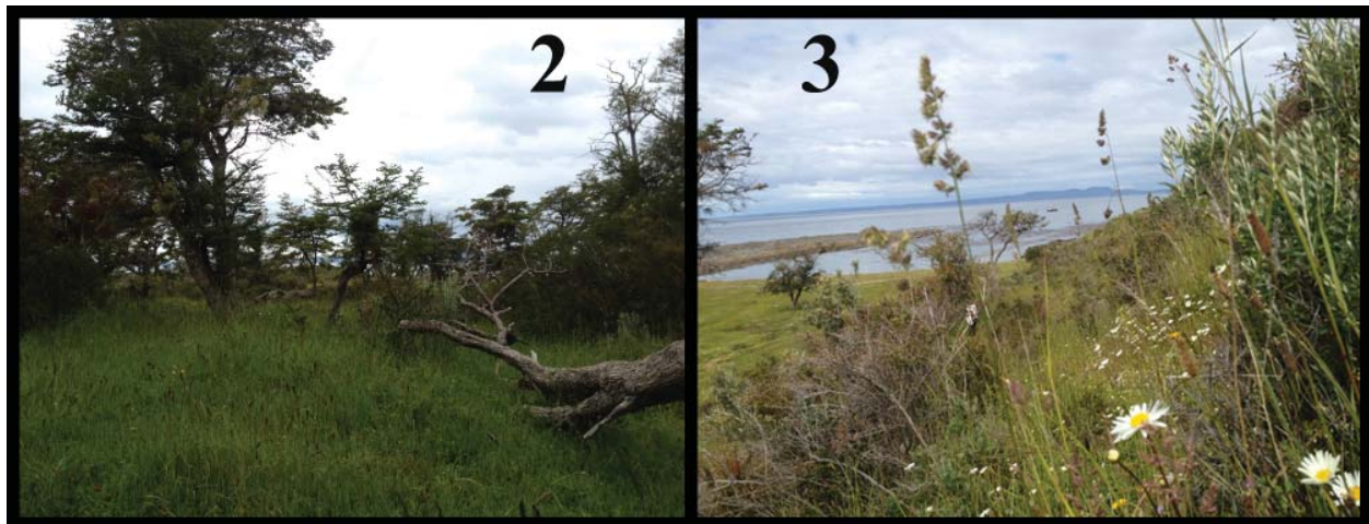
Figures 2-3. Habitat at Puerto de Hambre. 2) Wet wooded grassland similar to where the milliped was discovered; the trees are Nothofagus ?betuloides . 3) Dry shrubby grassland on slope leading to the Strait of Magellan, adjacent to the wetter site where the milliped was collected.

Brazil in general (Schubart 1946, Blower 1985, Korsós and Enghoff 1990). São Paulo State in general (Schubart 1963); São Paulo, Departamento de Botânica da Universidade de São Paulo (Schubart 1946, 1947).