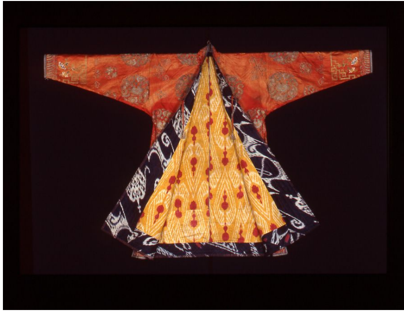
Fig. 9 Man's robe presented to Robert Shaw by Yakub Beg on the morning of April 6, 1869, before his departure from Kashgar. Silk satin embroidered with gold and silver metal thread couching and silk satin stitch, silk warp ikat lining. Ashmolean Museum, Oxford EAX3975.