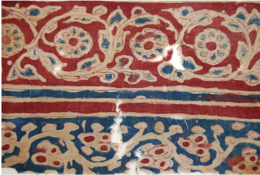
Fig. 2 Mordan and resist painted fragment. Gujarat, India, traded to Egypt, 13 th century. Cotton. Ashmolean Museum, Oxford EA1990.970.

Yet when I started working in the museum in 1990, only some of the tapestries and a few framed ‘Coptic’ textile fragments were on display. The Islamic, Indian and Chinese galleries did not have a single textile on view. When I mentioned the depth of the holdings, even some of my colleagues looked at me with surprise and asked: ‘Do we have any textiles?’