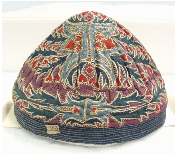
Fig. 6 Skull Cap. Eastern Turkestan, pre-1869. Silk and cotton embroidery on silk, quilted. Ashmolean Museum, Oxford EAX7399.

There was a considerateness in all this that made me feel quite friendly towards the old Shaghawal (governor) for the trouble he had taken to find out the things that would be agreeable to me, attending as much to my comfort as to the mere show of giving presents (1871: 186-7).