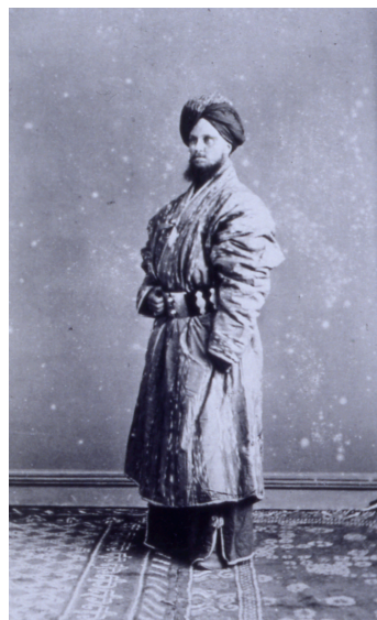
Fig. 4 Robert Shaw. British Library, India Office collections Mss Eur F197/36.

The answer was indeed interesting. The Pitt Rivers Museum also had some Central Asian material collected by someone named Shaw, but in this case the collector was referred to more explicitly as ‘Robert Shaw, author of Visits to High Tartary, Yarkand and Kashgar ’. The collection also had been kept in the Indian Institute initially, but was transferred to the Pitt Rivers in the 1930s. None of the objects were textiles, but included, e.g., carpenter’s tools, tinder boxes, pipes, and writing implements. Still, the connection was a promising lead: was this Robert Shaw identical with the Shaw who collected the Ashmolean’s coats? I spent an afternoon at the University’s Bodleian Library, looking up Robert Shaw’s book, published in 1871, two years after his travels. 6 It made for riveting reading; not only was it a lively and informative account of travelling in Central Asia in the mid-19th century, but it included numerous references to receiving, and wearing, local garments. Could these be the coats in our collection?