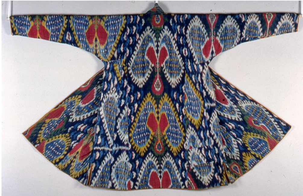
Fig. 3 Man's robe, Eastern Turkestan, pre-1869. Warp ikat, silk warp, cotton weft; cotton lining, quilted. Ashmolean Museum, Oxford EAX3977.

Initially my post was funded by a Getty grant, to catalogue and research the extensive Indian trade textiles. The grant also supported a textile conservator – a position never before held in the museum. Occasionally we ventured a bit further into the collections, to discover new delights not previously exhibited. A special treasure came to light on one occasion, when we were reorganizing some of the Chinese and Indian textile drawers. One drawer was set to rest briefly on an English 18th century Chinoiserie lacquer chest – at a staff meeting the Japanese curator had recently mentioned that it was filled with ‘Japanese armour of no value’. We both were curious, and the lid went up: inside were not odd bits of East Asian weaponry, but all the colours of the rainbow - the chest was stuffed full with 19 th century Central Asian ikat garments (Fig. 3).