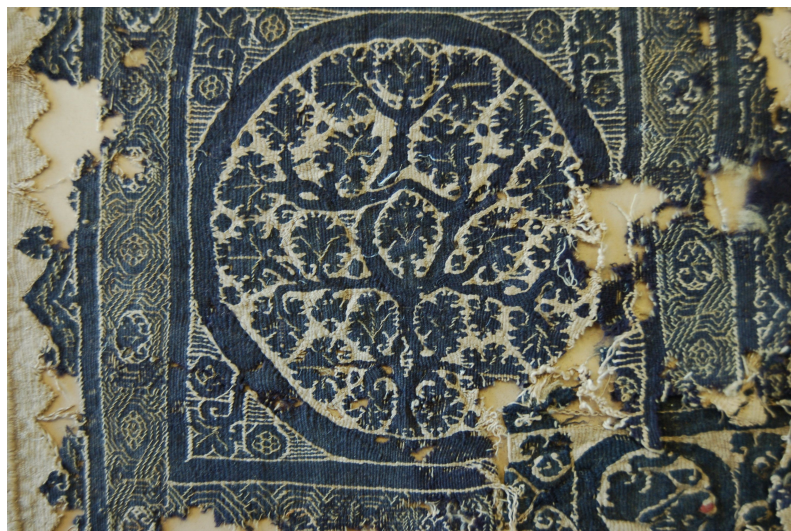
Fig. 1 Tapestry fragment. Egypt, late Roman period. Linen. Ashmolean Museum, Oxford AN 1941.3.

The Ashmolean Museum in Oxford has a significant collection of more than 6000 textiles, many of them remarkable for their value as works of art or as outstanding study collections. The Department of Antiquities has Egyptian Pharaonic textiles, as well as an exceptional collection of tapestry-woven fragments from Late Antiquity (Fig. 1). The Western Art Department has magnificent tapestries and fine English embroideries.