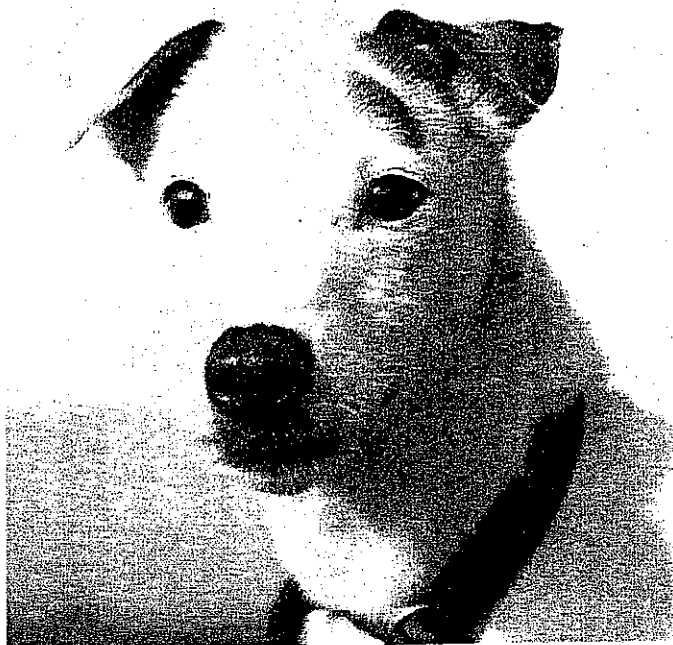
FIGURE 10.1 Snake-detecting Jack Russell terrier.

treesnake control technologies inoperable, the detectors dogs were able to resume duties the day after the storm (Vice and Engeman, 2000).