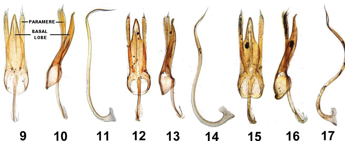
Figures 9–17. Male genitalia of Anovia punica . Peru: 9–11) San Martin State. Colombia: 12–14) San Andres Island. 15–17) Magdalena State. 9), 12), 15) Tegmen in ventral view. 10), 13), 16) Tegmen in lateral view. 11), 14), 17) Siphos.