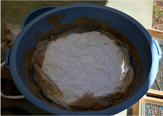
Fig.4 Preserved cocoons with salt made by Akira Shimura