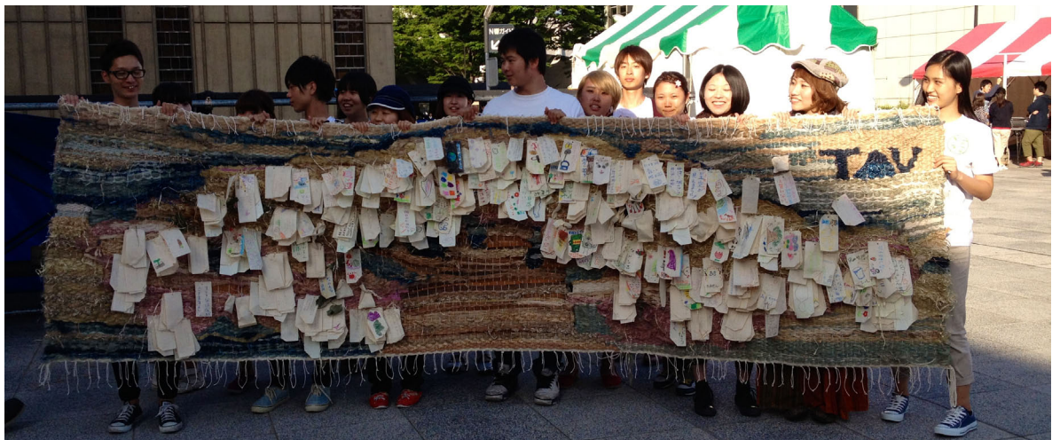
Fig.3 Let's Weave a Future Tree on 100% Organic Tapestry!' at 'ECO Park 2013: ECO Action for the Future The tapestry was woven and take it out from the loom.