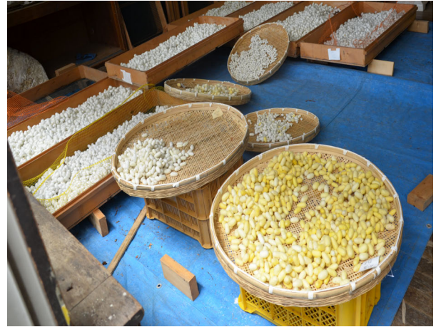
Fig.5 Preserved cocoons with salt were prepared to reel them out.