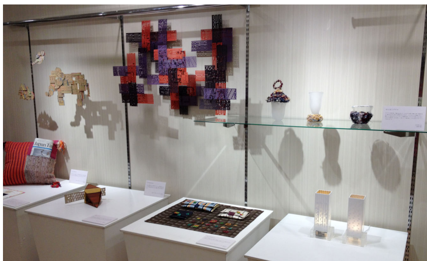
Fig.1 Textile products made of waste materials designed by student of TAU

Another is sustainable design for Iriomote Island in Okinawa where the traditional life style has been still preserving 10 . For introduction to sustainable design, I and Yuka Kawai 11 , a professor of TAU, lead students to an ecological demonstration, 'Lets Weave a Future Tree on 100% Organic Tapestry!' at 'ECO Park 2013: ECO Action for the Future' sponsored by Japan Broadcasting Cooperation,