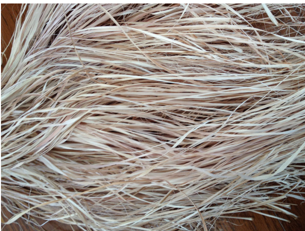
Fig.6 A bunch of kawa-basho peeled out from outer skin of Japanese fiber bananas made by the author