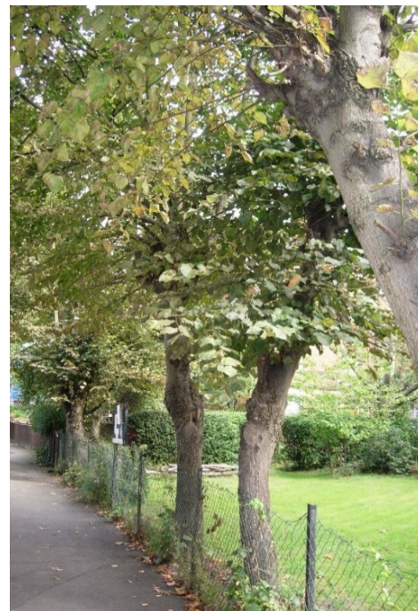
Figure 5. Right: Lime trees ( Tilia sp.) – the source of lime bast fibres.