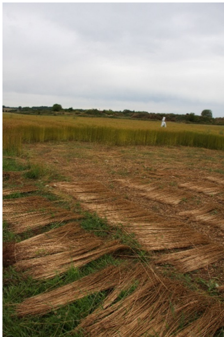
Figure 4. Left: Modern flax field ( Linum usitatissimum ) with harvested crop dew-retting in the foreground.

sources of fibre were used by farmers alongside flax fibre is attested by their abundant use for cords, ropes, nets and twined clothing in the Middle to Late Neolithic alpine lake dwellings in sites dated from the late fifth millennium to third millennium BC (Rast-Eicher 2005, 118-119; Rast-Eicher 1997, 302-303). Indeed overall, there are more preserved cords, threads and