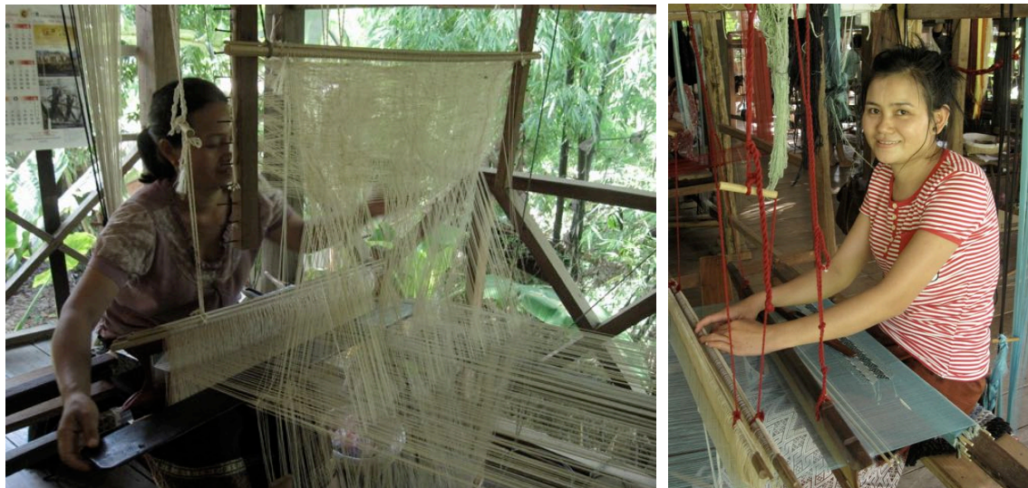
Figure 1: Weavers at the Ock Pop Tok Living Crafts Centre, Luang Prabang, Lao PDR.