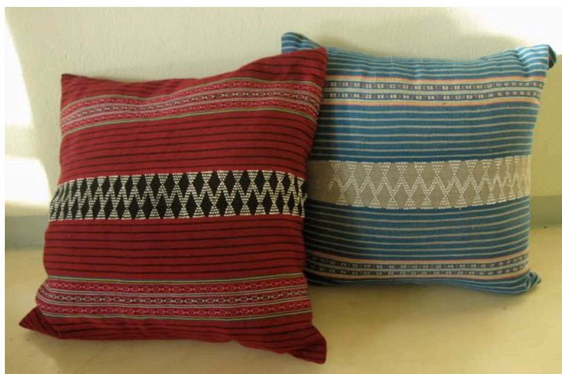
Figure 2: Pillows made from Katu woven cloth, at Ock Pop Tok.