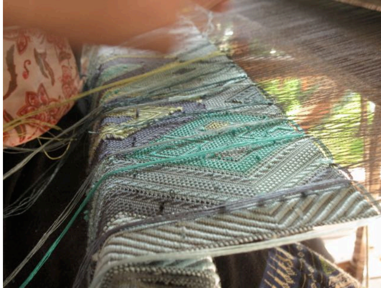
Figure 5: Kiang weaves a discontinuous supplementary weft pattern requiring a high level of skill, at Ock Pop Tok Living Crafts Centre.

Congruent with the emphasis on skill is the importance of quality as a factor of sustainability. Most traditional cultures with exposure to tourism have experienced the tendency to create cheaper, quicker versions of their traditional craft in order to sell at a profit. But this is the trend that degrades the craft heritage, threatens the artisan's abilities, and devalues both the product and the consumer. This is where I would like to take an optimistic turn, highlighting the ways in which promotion of quality, skill, and knowledge improve the prospects for traditional textile making and even offer some redemption for the tourist.