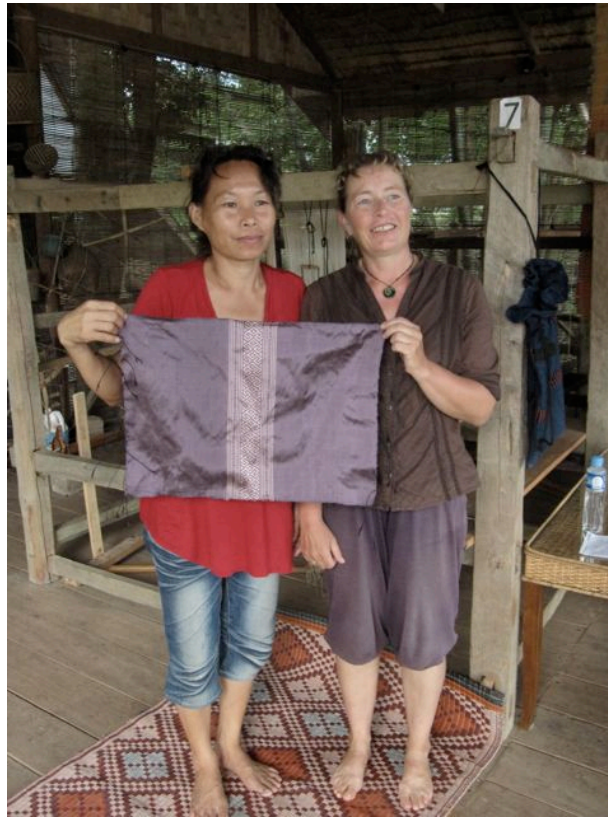
Figure 7: A Dutch tourist and her Lao weaving teacher show off her finished piece at Ock Pop Tok LCC.

The weaving lessons at Ock Pop Tok have an appeal beyond textile practitioners: the woman in figure 7, from the Netherlands, said she had never done anything like this before. Another weaving student, from the US, came for two whole days to make her mother a scarf. She had thought about buying a gift, and then found out she could make one herself. Even though the situation is streamlined for minimal effort (weaving teachers weave as much of the scarf as necessary to ensure that it gets finished, and they manipulate the heddles and pattern sheds for the students,) a student/teacher relationship is set up briefly, and the visiting tourists are reliant on the Lao women's knowledge, which is an important dynamic in a place where tourists are in general wealthier and representative of some idealized modern global culture. Placing weavers not merely on display, but rather in instructive positions as with these classes and CTTC is a significant shift of power that reinforces the sense of identity connected with traditional textile crafts.