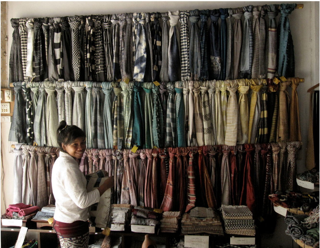
Figure 4: Handwoven silk scarves for sale at Ock Pop Tok showroom, Luang Prabang, Lao PDR.

And how many scarves does the developed world need, anyway? Can the overseas luxury market really sustain the weavers of Laos?