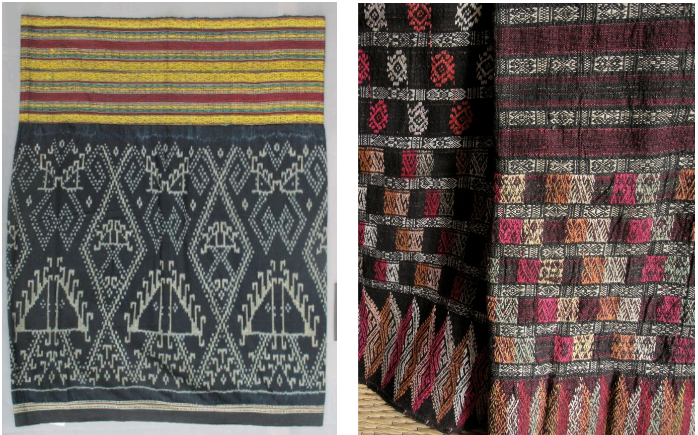
Figure 3: Different types of skirts or 'pha siin': Ikat shaman skirt with supplementary warp border, left; Silk and cotton skirts with supplementary warp and weft designs, right. Collection of Ock Pop Tok.

Attention from development programs leads to increased visibility, which makes a certain tradition known above others. While I was in Laos, Katu weaving was definitely the hot thing, visible everywhere. And online, there is evidence that this tradition is the most visible. Laos has roughly 150 different ethnic groups, with 20 or more in the general vicinity of the Katu (Salavan and Champasak Provinces.) The Katu have been supported and promoted as artisans, but this doesn't mean that their work is the only traditional weaving in the area.