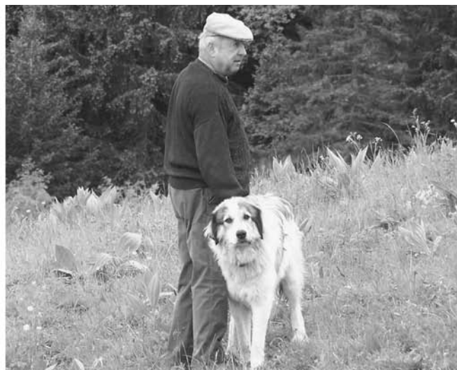
Figure 3. Livestock protection dogs (LPDs) are partners and companions in a producer’s operation. The ability of LPDs to monitor pastures continuously can lead to psychological peace of mind and lower stress for producers.