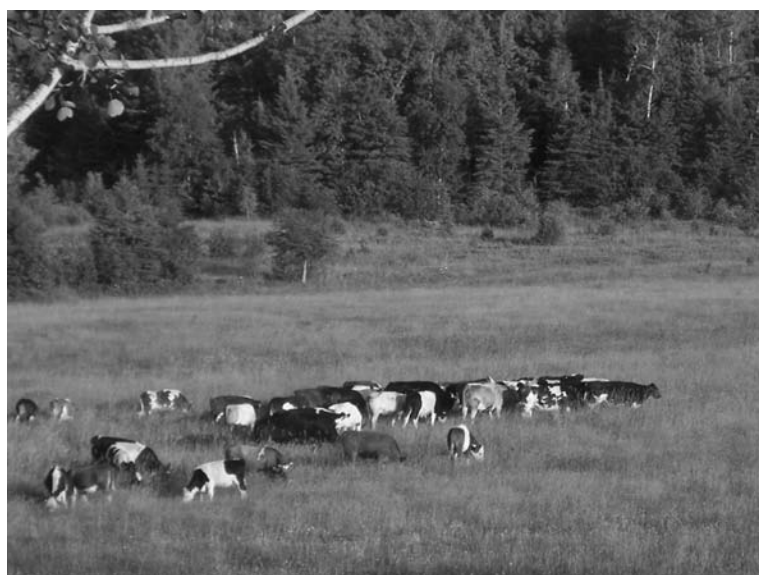
Figure 2. In the northern Great Lakes region of the United States, farm pastures are relatively small, confined grazing systems surrounded by forest. Livestock protection dogs can be fairly easily integrated into this type of grazing system.

Worldwide, there is some variation in how LPDs have been applied by producers relative to geography, the producer's husbandry practices, and grazing situations. For example, in Sweden and the Great Lakes region of the United States, LPDs are often used in fenced pastures (figure 2; Levin 2005, Gehring et al. 2006, VerCauteren et al. 2008).