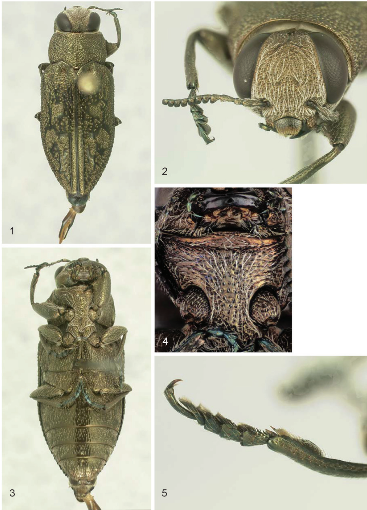
Figures 1–5. Chrysobothris cerceripraeda Westcott and Thomas, n. sp., male. 1) Dorsal habitus. 2) Front of head. 3) Ventral habitus. 4) Prosternum. 5) Protibia.