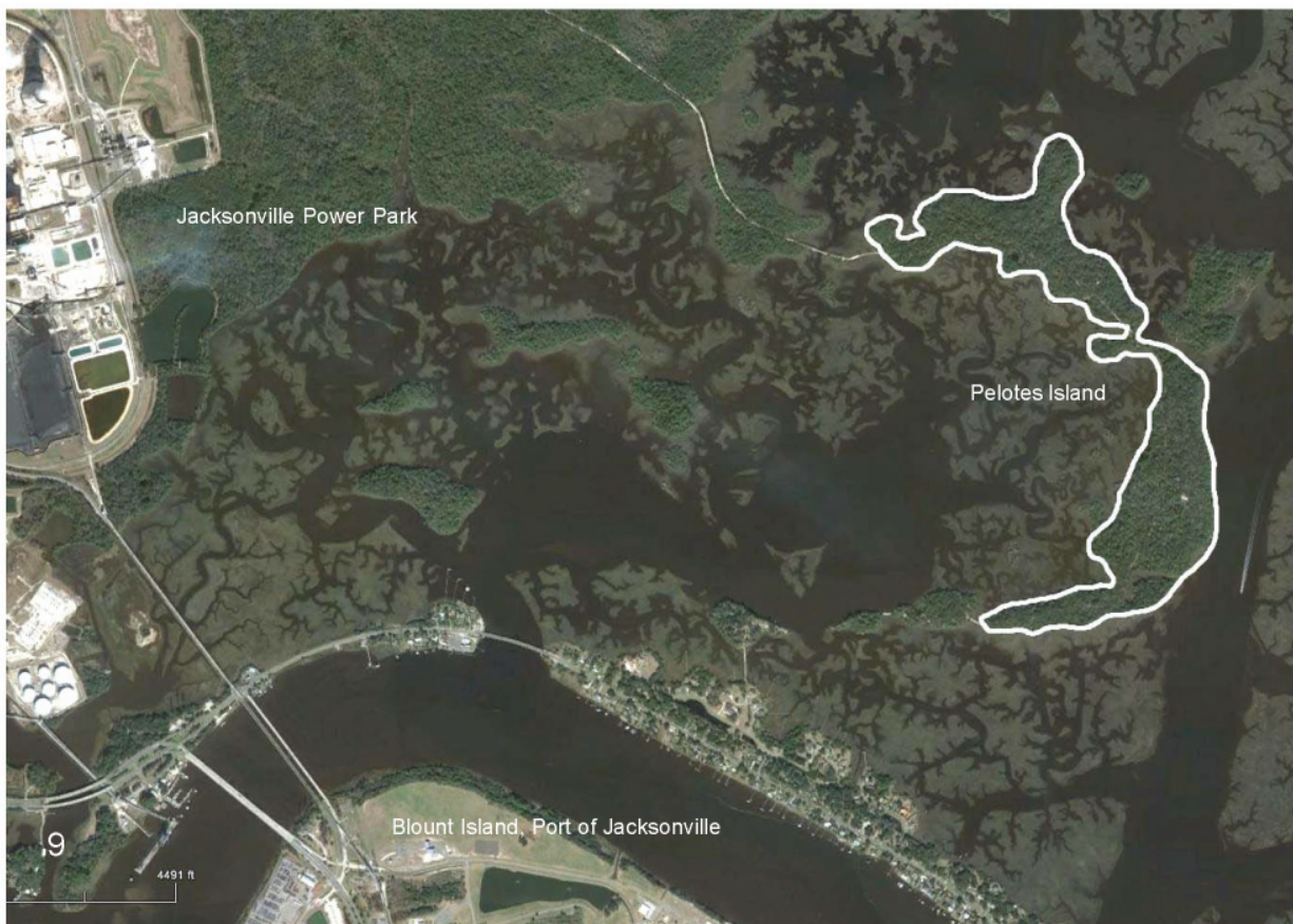
Figure 9. Google Earth image of Pelotes Island (outlined in white) and vicinity.