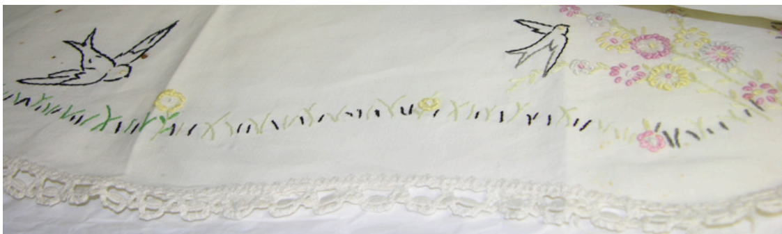
Figure 4. Carver's embroidery samples. Tuskegee Institute National Historic Site.

Existing examples of Carver's embroidery work, suggest that he was quite proficient in this textile design technique. The examples include embroidery stitches such as cross-stitch, running, satin, blanket bullion and French knots used to create flora and fauna motifs. Often the samples are completed with crocheted edges in lace patterns.