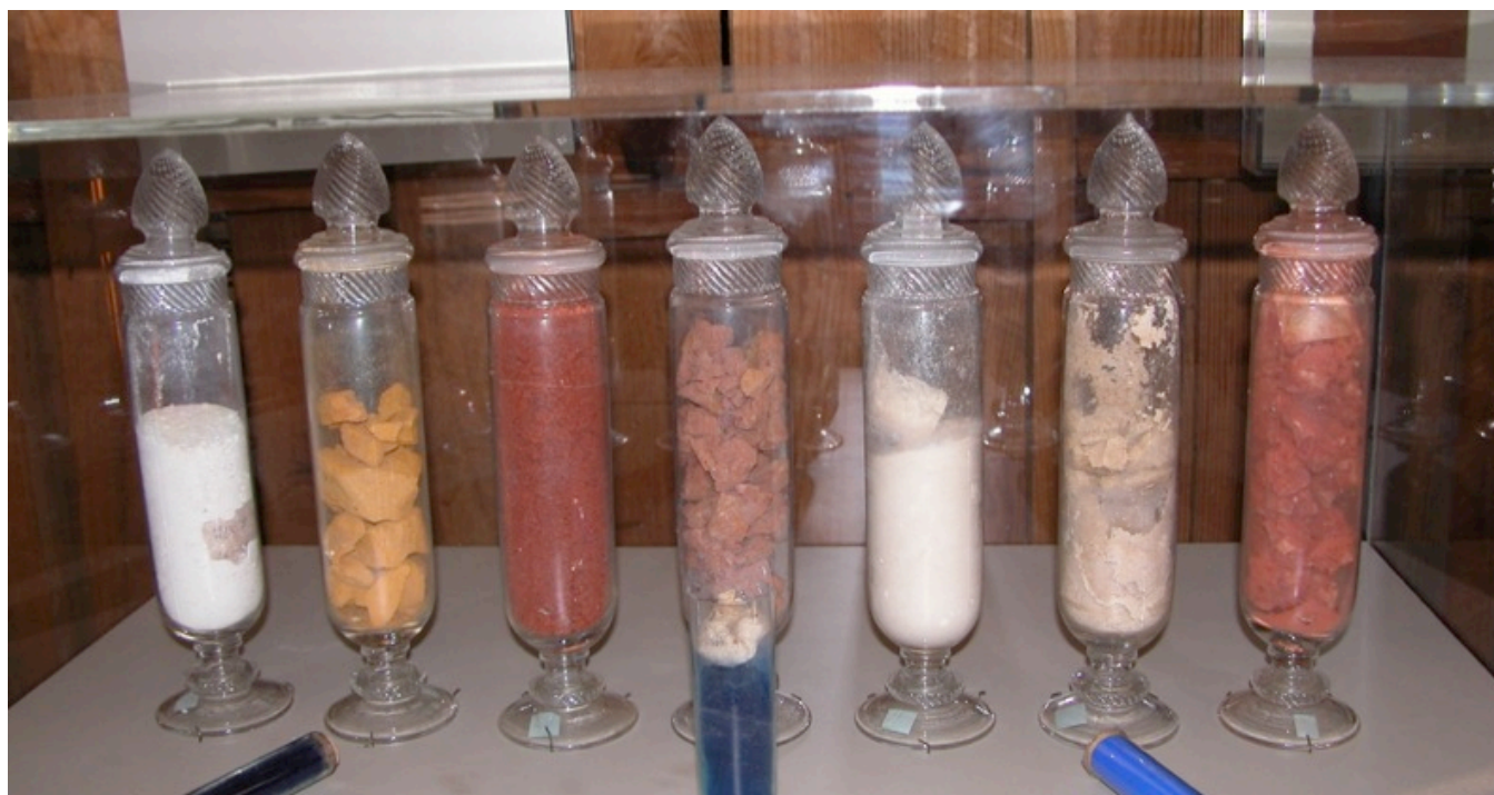
Figure 7. Examples of minerals and pigments organized in Carver's laboratory. Tuskegee Institute National Historic Site.

Carver's textile dye work also consisted of: a) developing a process for producing paints and stains from natural clays for which three separate patents were issued (Tuskegee University 2014) and b) rediscovering Egyptian blue dye (Fig 7) a royal blue color extracted and oxidized from clay (Elliott 1966; Halvorsen 2002).