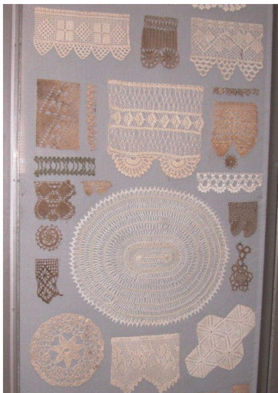
Figure 3. Carver's crochet samples. Tuskegee Institute National Historic Site.

The majority of the holdings are at Tuskegee; however, a few are on loan to George Washington Carver National Park in Diamond, Missouri. The crochet samples examined were small in dimension, 12 inches and less created from narrow denier yarns and threads. Some have single motifs, while others have repeated motifs. The motifs were often organic in nature, such as botanic and floral or were recognizable religious symbols such as a cross. Carver employed a variety of stitches such as, chain, single crochet, double crochet in mainly fillet pattern and lace patterns. The shapes of crochet samples are generally circular or rectangular. A few of the samples are reminiscent of lace trims (Fig 3).