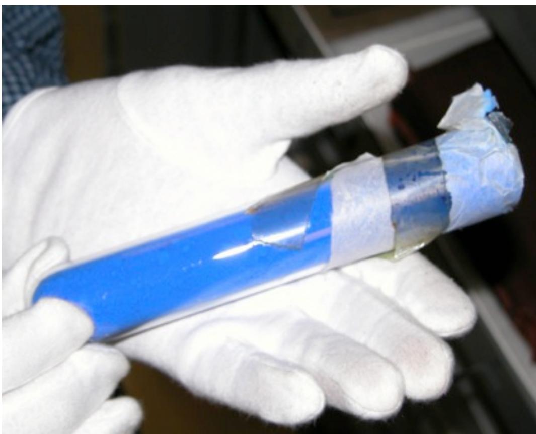
Figure 8. Egyptian Blue pigment Carver is credited with rediscovering. Tuskegee Institute National Historic Site.