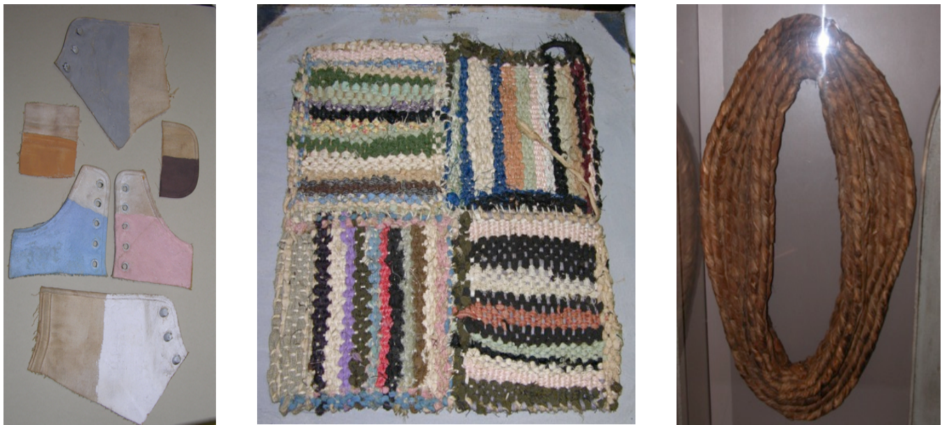
Figure 6. Painted leather, weaving, and basketry by Carver. Tuskegee Institute National Historic Site.

Scholars verify that Carver extracted lavender and deep orange color pigments from peeling of the sweet potato (Hersey 2006). He was inspired by the soil and clay of Alabama and used them to extract dyestuffs and pigments. Carver believed that the “waste not, want not” principle was a key to being a good steward of the good earth and he urged to save everything “from what you have make what you want” (Bolden 2008, 27). Statements about Professor Carver’s work such as: “tomato vines serve as a source of dyes for fabric” (Hersey 2006, 252) and “dyes from the common clays of many states” (Wright 1946, 270) attest to his use of sustainable materials to color textiles plus documentation in his letters held at the Carver National Monument.