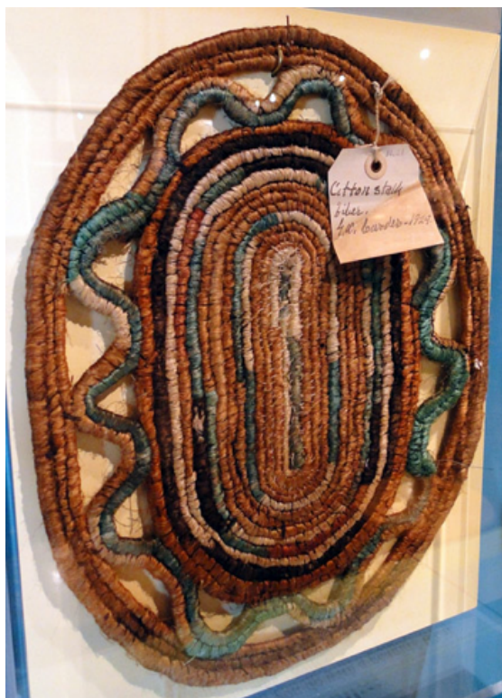
Figure 5. Carver's basketry sample. Tuskegee Institute National Historic Site on loan to the Carver National Monument. Image by Eulanda A. Sanders.

Interestingly, Carver's basketry and weavings were less refined than his crochet and embroidery. His basketry was created through coiling natural fibers, such as cotton stalks in flat mat oval forms. The mats observed in this preliminary research featured a solid central coiled area bordered with an open wave pattern enclosed with an additional solid coiled border. The mats were mainly brown; however, dyes were thoughtfully used to color sections of the cotton stalks as seen in (Fig 5). The one woven textile create by Carver, examined in this research are four separate hand-woven squares all with the same warp yarn, but with various warp yarns. The rusticity of the samples indicates that they were not woven on a loom.