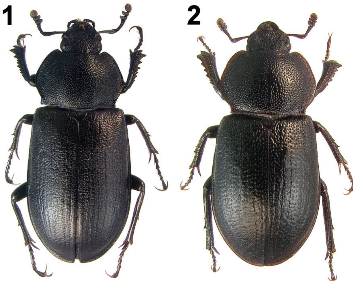
Figures 1–2. Dorsal habitus of paratypes of Platyceroides marshalli , n.sp. 1) Male. 2) Female.

Description, holotype. Coleoptera: Scarabaeoidea: Lucanidae: Lucaninae: Platyceroidini. Length : 11.2 mm. Width : 5.0 mm. Color : Shiny black, with subtle violet metallic reflection. Head : Form narrow anteriorly, with gena not produced laterally as far as eye. Antennal club small (about 1/2 length of scape), distal antennomere of club smaller than dorsal surface of eye, antennomeres of club not entirely tomentose. Labrum relatively large, subequal in size to median antennomere of club. Mandibles simply falcate, externally rounded. Pronotum : Surface shiny (minutely alutaceous) with moderately deep punctures; punctures dense, generally separated by about 1 puncture diameter, distance between punctures becoming greater on center of disc and at sides. Elytra : Surface alutaceous, weakly shiny, with moderately deep punctures, some in vague rows, but striae not distinctly impressed or complete. Wings : Wings fully developed. Legs : Meso- and metatibiae not distinctly slender as in P. potax . Abdomen : Male genitalia with permanently everted internal sac sclerotized, elongate, with capitate apex; apex narrow, not strongly expanded dorsoventrally as in other species (see Fig. 6–8).