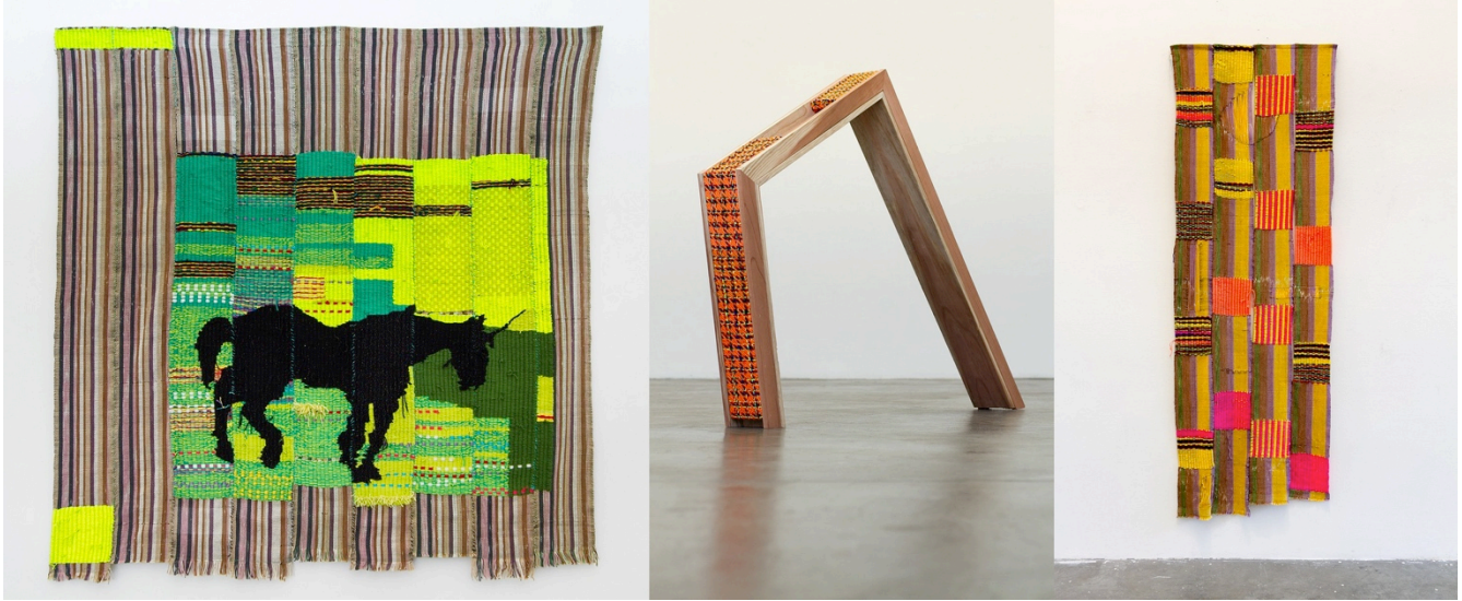
Right to left: Unicorn Kente. 2014. Hand woven cotton and acrylic, 6'x6'