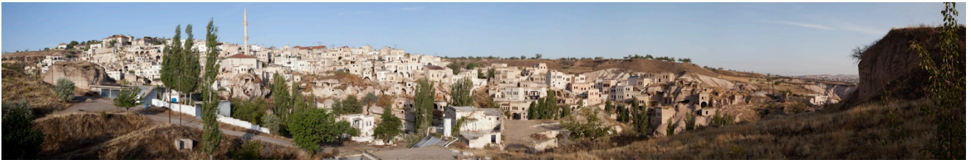
Figure 4 - İbrahampaşa Village, Ürgüp, Turkey, 2012.

In April 2013, I relocated to İbrahampaşa, a small village in Cappadocia that contains a number of different edges, both spatial and conceptual. It is a place where regional tourism is slowly seeping in, with one hotel open and two more under construction. It is a place where the women are on the edge between traditional village gender roles and a new version of femininity, which