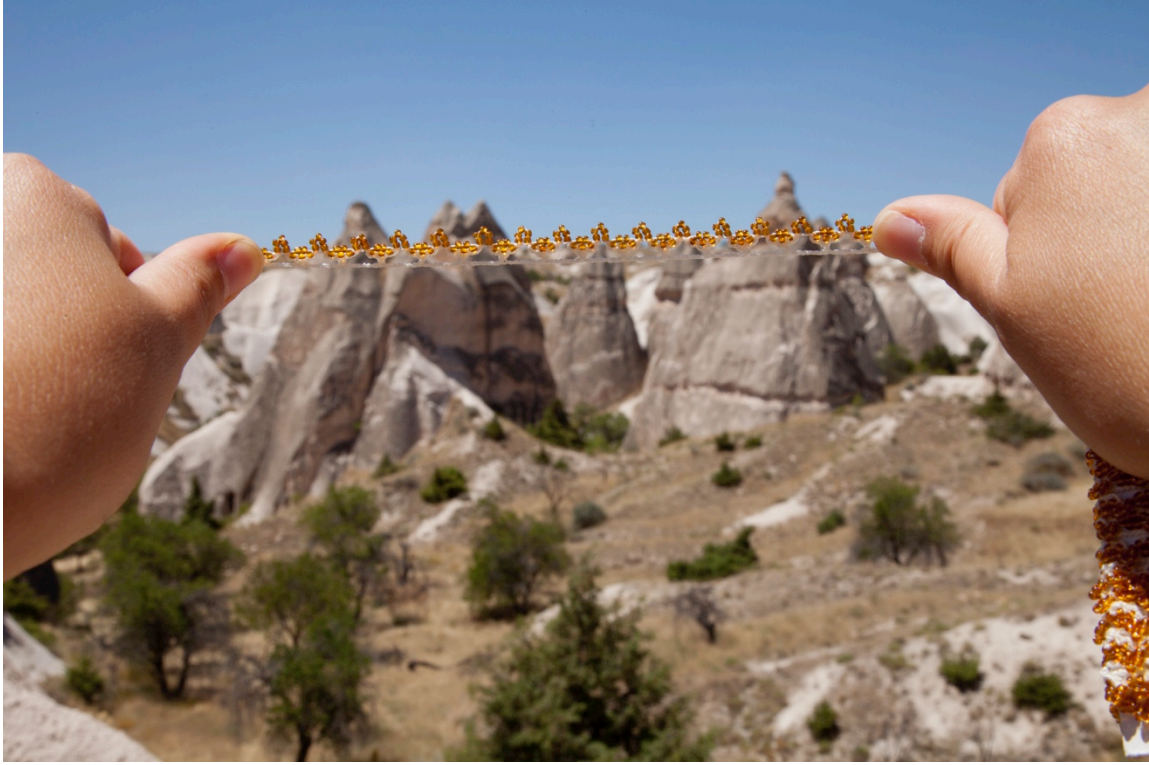
Figure 5 - Yürüyüş Oyası (Turuncu Boncuklar), 2013.

In addition to the public/private divide in İbrahampaşa and my urban sense of privacy in public space, the gendering of the public space in the village was unfamiliar to me. Women were not generally seen in the public square of the village, and mostly stayed inside and in the areas directly adjacent to their homes. Women also always traveled in pairs or groups. As a foreign woman, my gender identity was more fluid, allowing me to enter the dominantly male spaces of the village. Specifically, it was acceptable for me to spend time in the village square and at the coffee house, though I found it uncomfortable. Some of the doors in the village contained Ottoman era remnants of an even more starkly divided village, where door knockers, through their sound, and even separate doors, signaled the gender of visitors, so that a woman alone at home would never have to open the door to a man.