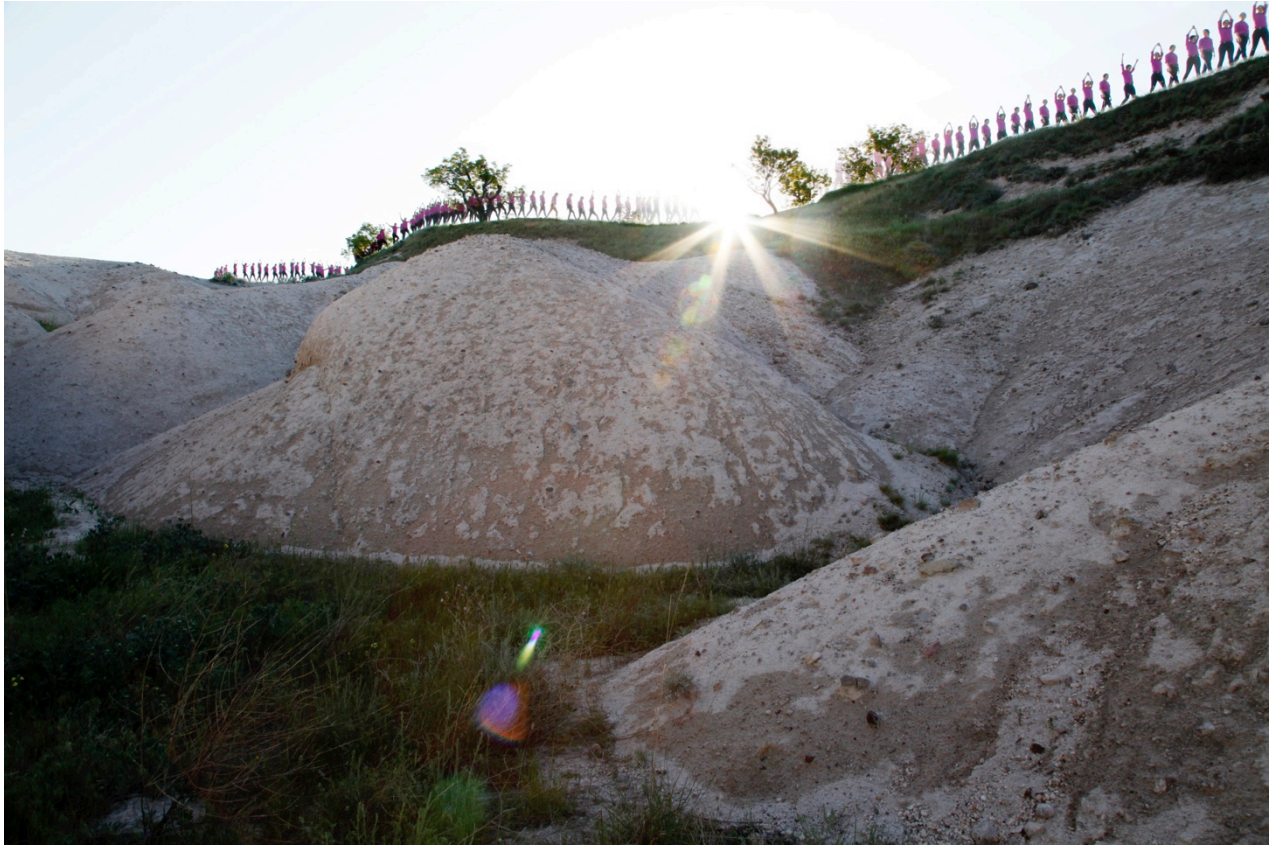
Figure 6 - Yürüyüş Oyası (Sunrise), 2013.

With these restrictions, I quickly turned away from making material installations. I decided to use the walking I had been doing as a new way of demarcating an edge in the landscape. Being a photographer, I decided to use my camera to document my walks and to trace some of the crumbling edges in the visibly eroding landscape. I started close to home, setting up the camera on my balcony, using my computer to delay and then shoot pictures at a regular interval. I would start the timer, and then venture through the valley into the frame of my camera, beginning my precarious walk along the edge of the table mountain, trying to define the edge where the horizontal table mountains turn into valleys. In my initial location, I was visible to the village, and found myself occasionally in conversation, across the valley, with others wondering what I was doing in my crazy, slow, and deliberate walk for the camera hidden from their view. As I refined my camera technique, I traveled further afield, packing a backpack with just my tripod, camera and extra clothes. While I considered getting the village women and children involved in my project, the coordination that would have been necessary to get people in cars, due to their aversion to walking so far afield, seemed counter to the self-sufficiency and mobility of the project. In the end, I used only my own body. Most of the pictures were taken entirely alone, with myself being the only person in the visible landscape.