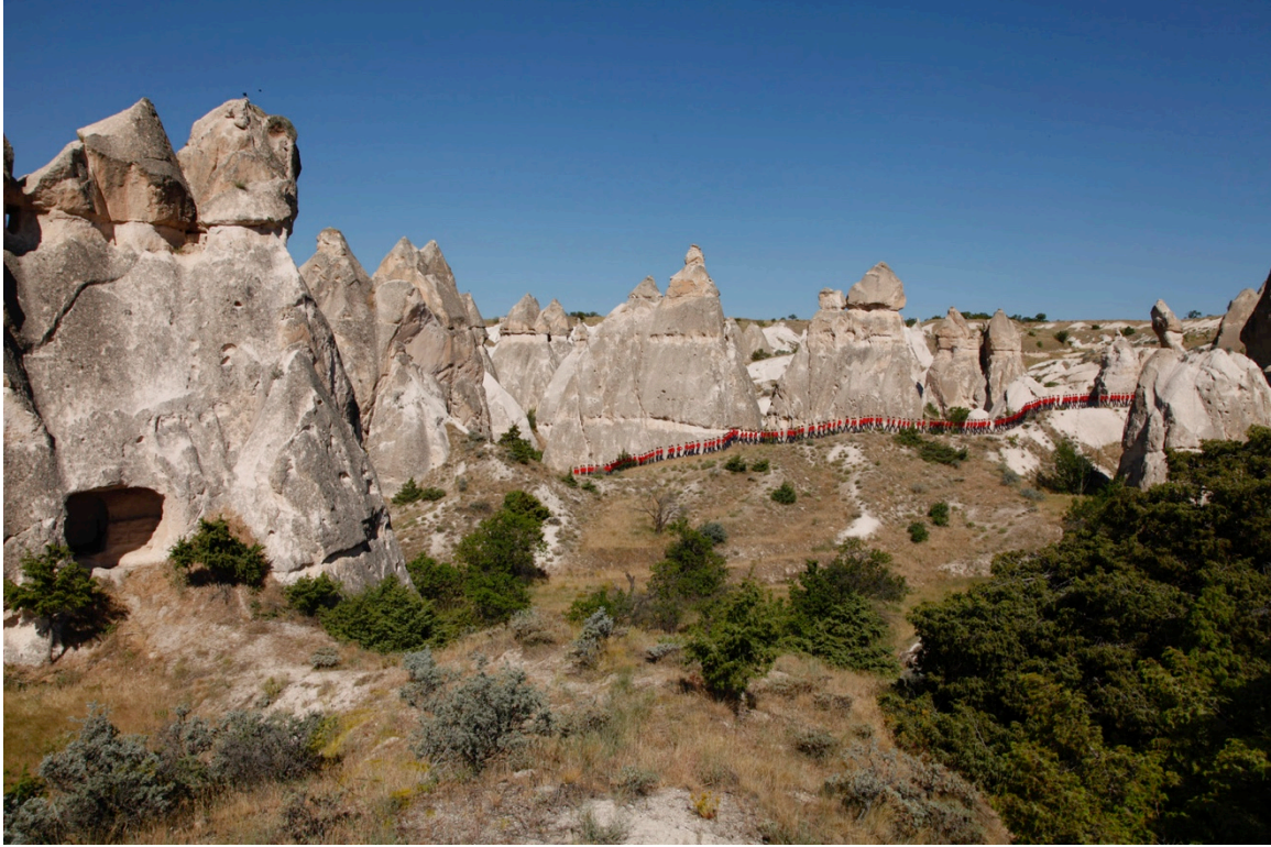
Figure 7 - Yürüyüş Oyası (Kırmızılı Manzara), 2013.

After the photography was complete, I would make quick renderings in Photoshop of the final images, to make corrections and evaluate the day's work. In total, I created approximately 55 different compositions over the course of nine weeks, resulting in about a dozen images that were shown at my open studio in İbrahampaşa in June of 2013.