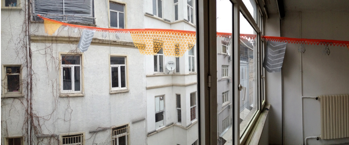
Figure 3 - Panorama, PasajIST, Istanbul, 2013.

Taking my inspiration from the cityscape of Izmir, I developed my oia using two motifs: the Izmir mountains and the International Style apartment blocks. Using my basic knowledge of the knotted triangular structure of İğne Oyası, I proceeded to make drawings from oia pattern books and eventually translated these drawings into cutouts in the balcony tarp. The open work triangle structure of oia referenced the “mountains” of my Izmir landscape. I then placed the forms of the apartment blocks and their prominent balconies within the mountain motifs. These patterns were all drawn onto the tarp and then cut by hand, using a sewing machine to construct a long strand using the regular pattern interval of oia.