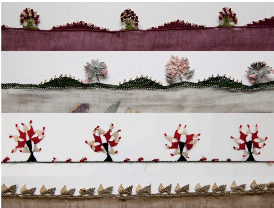
Figure 1 - İğne Oyası examples, personal collection of the author. All images are copyright of the author unless otherwise specified.

There are many varieties of oya, and when I began my investigations, I was fully expecting to find a range of different floral, foliate and abstract motifs, many of which have narrative, expressive meanings for the women who wear them. Most famously, the red pepper oya suggests hot or spicy (i.e.: angry) feelings, often directed towards one's husband or mother-in-law. What I was not expecting was the portrayal of entire landscapes. Mountains were featured, and sometimes trees or bushes. The action of wearing a needle lace depiction of a landscape around one's face was of great interest to me. Oya exists as a boundary between private bodies and public presentations, with the ability to give an outward projection of inner thoughts. The idea of a landscape motif serving this function fascinated me—particularly the extreme shifts in scale, and the contrast of something so big and so emphatically “exterior” playing the role of projecting emotions in a delicate edge.