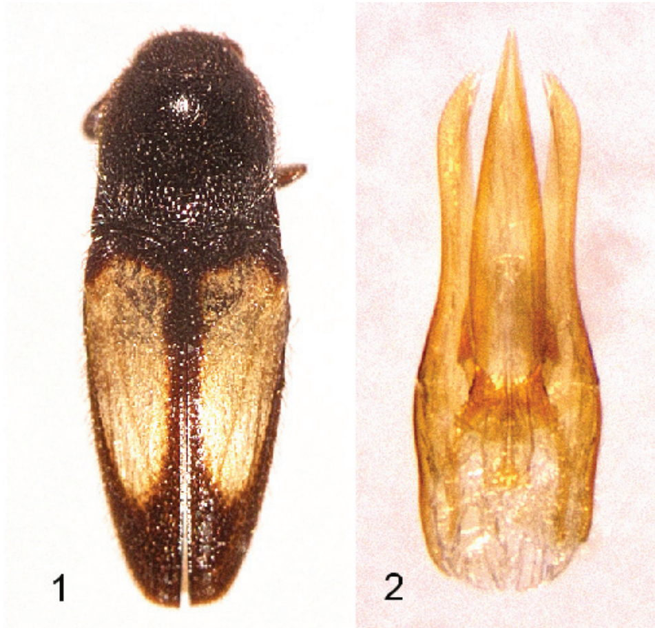
Figures 1–2. Drapetes chiricahua , new species. 1) Adult male, dorsal habitus. 2) Aedeagus, dorsal aspect.

Female (n = 1) externally similar to male; slightly broader in silhouette.