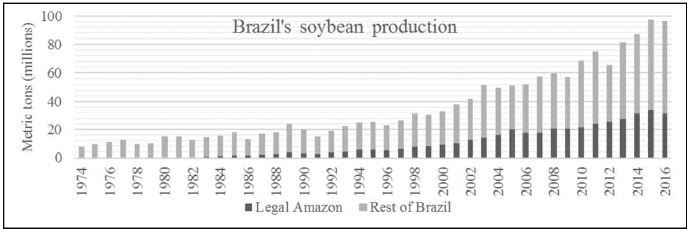
Figure 1. Brazilian soybean production, 1974 to 2016.