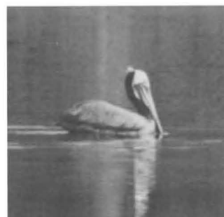
at DeSoto WR, May 6, 1992

Editor's Note: NBR Vol. 59 (3), 1991, p.93, had reports of two Brown Pelicans in May, 1991, one in Dodge Co. and the other in Dakota Co.