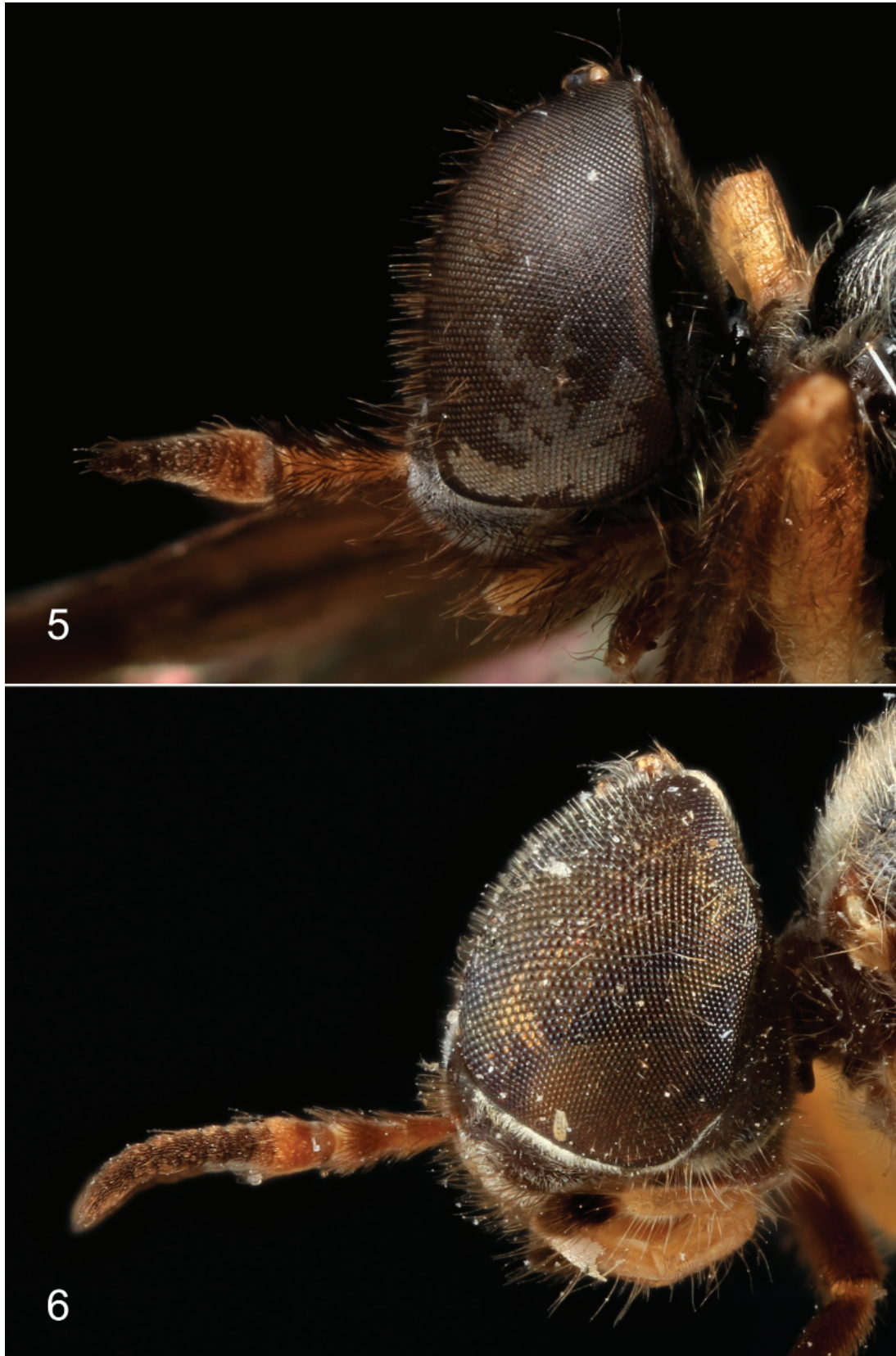
Figure 5. Holotype male of Paraberismyia imitator , n. sp. 5) Lateral view of head (mirror image). Figure 6. Male of Berismyia fusca Giglio-Tos. 6) Lateral view of head.