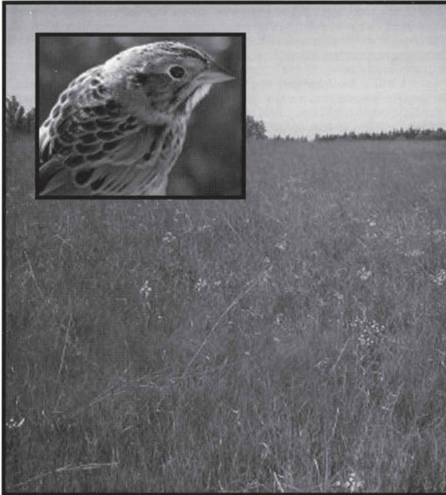
Henslow's Sparrow habitat: Pawnee Prairie WMA, Pawnee County, Nebraska Inset: Juvenile Henslow's Sparrow

W. Ross Silcock P.O. Box 57 Tabor, IA 51653 712-629-5865 silcock@rosssilcock.com