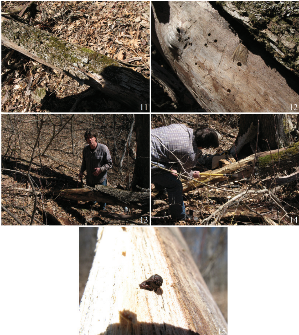
Figures 11–15. Stethon pectorosus collecting event. 11) Rotten elm limb. 12) Exit holes. 13) Senior author preparing to split the limb. 14) Senior author splitting tree limb. 15) Adult cadaver in exit hole.