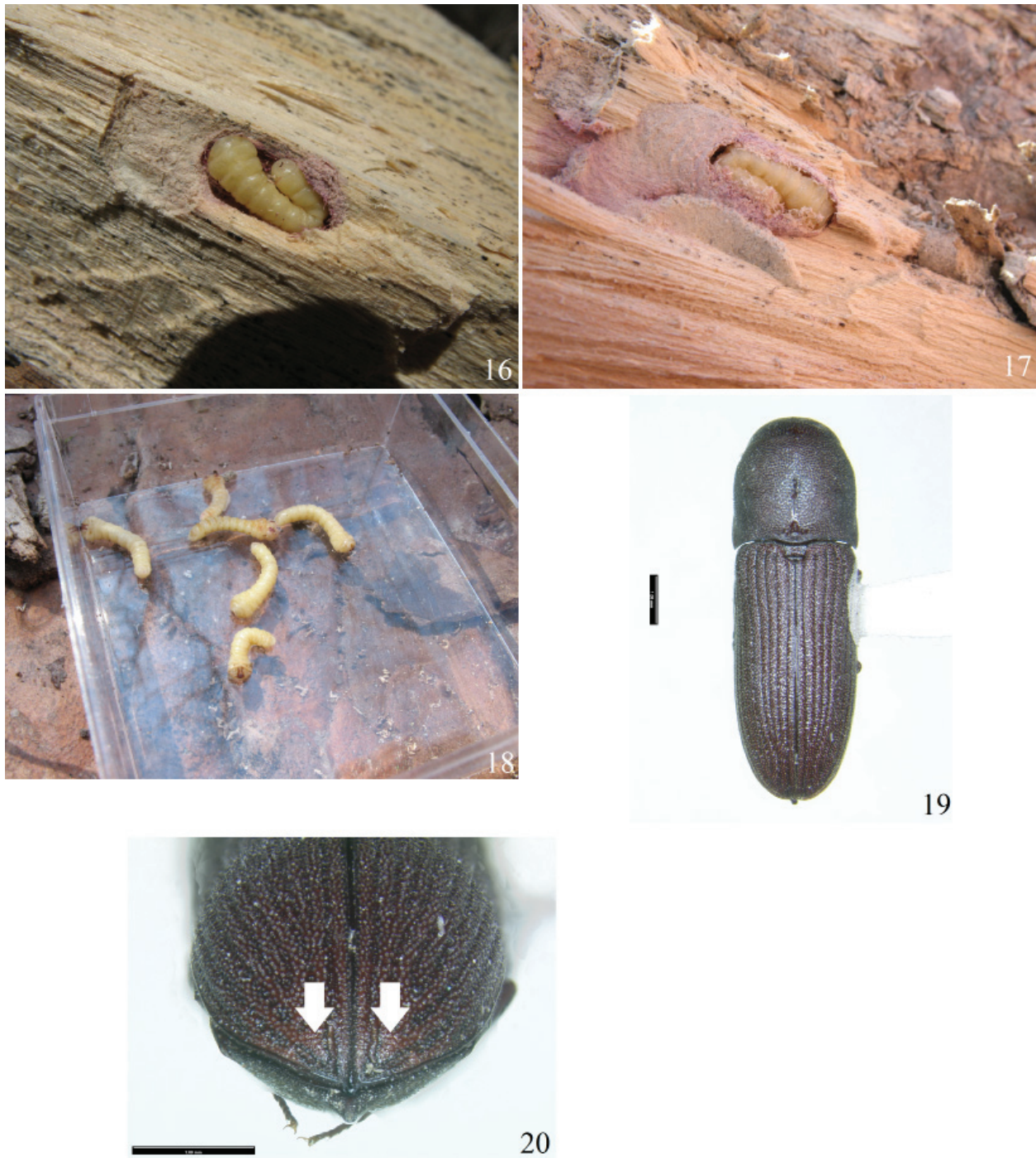
Figures 16–20. Stethon pectorosus collecting event and adult. 16) Prepupal larval stage in pupal cell. 17) Prepupal larval stage with purple- colored stain. 18) Collected fifth instar and prepupal larval stages. 19) Dorsal habitus. 20) Posterior habitus of adult illustrating deep, V-shaped exoskeletal cavities at elytral apices as indicated with white arrows. Scale line = 1.0 mm.