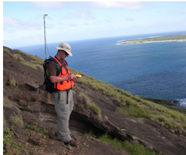
This shows environmental monitoring plot GPS data collection.

Biological surveys were again conducted on Lehua in the late 1990s, and the impact of rats and rabbits on the island ecosystem were well documented. After consultation between HIDLNR and Fish and Wildlife Service (FWS) biologists, it was decided that eradicating the rats and rabbits would be the prudent management action. The Lehua Island Ecosystem Restoration Project was founded for this purpose. This project also focused on restoring native plant communities and allowing recolonization of the island by seabirds. The original Environmental Assessment (EA) and Final Supplemental EA were approved in September 2005 and October 2008, respectively.