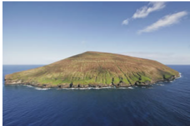
Lehua Island.

Lehua Island is an uninhabited, 290-acre crescent-shaped volcanic cone located approximately 150 miles north-northwest of Honolulu, Hawaii, or approximately 20 miles west of the island of Kauai. Lehua is a state-designated seabird sanctuary managed by the Hawaii Department of Land and Natural Resources (HIDLNR) and federally owned by the U.S. Coast Guard. Renowned for its diversity of nesting seabirds, it is home to at least 17 recorded species of seabirds, including, but not limited to, colonies of Laysan and black-footed albatross, red-footed and brown boobies, black noddies, and Newell's shearwaters. Lehua is also home to several species of native coastal plants and insects.