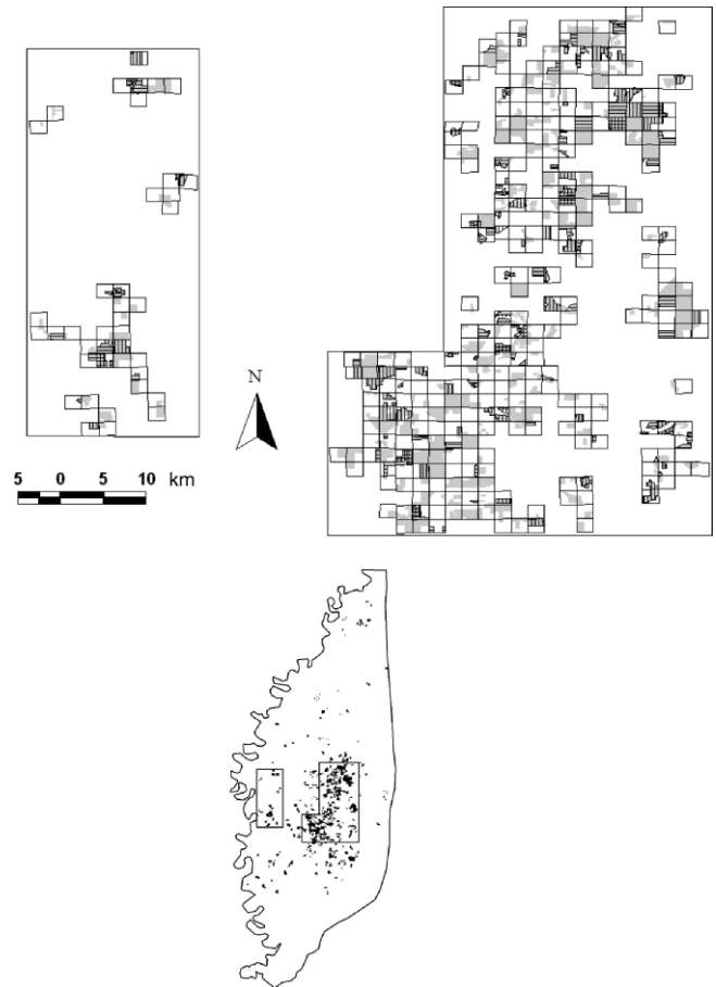
Figure 2. Study area for estimating distribution and abundance of double-crested cormorants in the primary aquaculture producing area of the Yazoo River Basin of Mississippi, USA. Bounded areas represent river and interior regions; shaded areas represent clusters of catfish aquaculture sampled in winter (Oct–Apr). Vertical bars represent clusters sampled in winter 2000–2001; horizontal bars represent clusters sampled in winter 2003–2004; cross-hatched areas represent clusters sampled in both winters.

aerial surveys to provide an estimate of mean and total number of cormorants on clusters. We used SCS to estimate cormorant occurrence and abundance within the sample frame (Christopher et al. 1986). The sample frame contained approximately 67% of the total water surface area in production (National Agriculture Statistics Service [NASS] 2004). We defined clusters (primary sampling units) as all aquaculture ponds within a given United States Geological Survey (USGS) land survey section (Fig. 2). We determined clusters by overlaying USGS land survey section polygons (1993; 7.5-minute quadrangle) over a Geographic Information System (GIS) coverage of ponds in the Yazoo Basin (Landsat L7, Enhanced Thematic Mapper, orthorectified, terrain corrected, \pm 15 -m resolution) provided by Ducks Unlimited Inc. (Memphis, TN). We considered a pond (secondary sampling unit) within a cluster if >50\% of the pond was within the section. We assumed clusters of ponds to be representative of ponds on individual aquaculture farms. During aerial surveys, the pilot circled selected clusters at an altitude of 100–150 m above ground level. The observer counted and recorded all cormorants observed in each pond and we surveyed all ponds in each cluster. Cormorants typically respond to the aircraft by