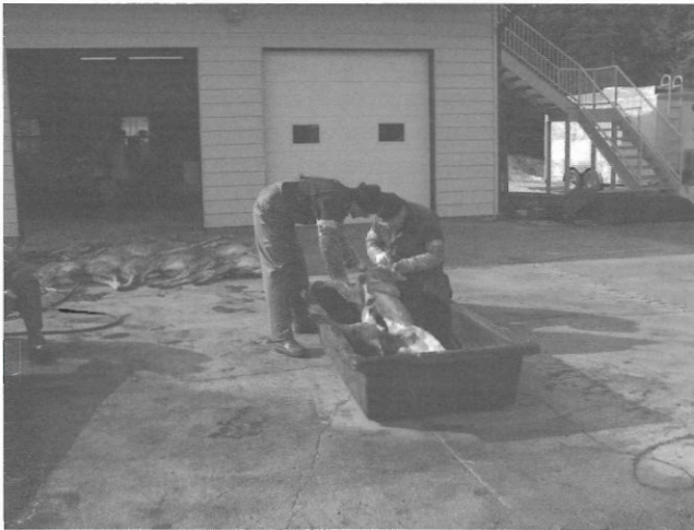
FIGURE 7.4 Tissue collection from white-tailed deer for presumptive diagnosis.

Macroscopic examination of suspect tuberculosis lesions is frequently used to presumptively diagnose M. bovis infection postmortem (Figure 7.4) (Clifton-Hadley et al., 2001; de Lisle et al., 2002; Mackintosh et al., 2002). Histopathologic examination of suspect tuberculosis lesions and bacterial culture are the primary means used to diagnose M. bovis infection (de Lisle et al., 2002; Mackintosh et al., 2002). Another diagnostic test for deer includes a composite immune cell and antibody test (Mackintosh et al., 2002).