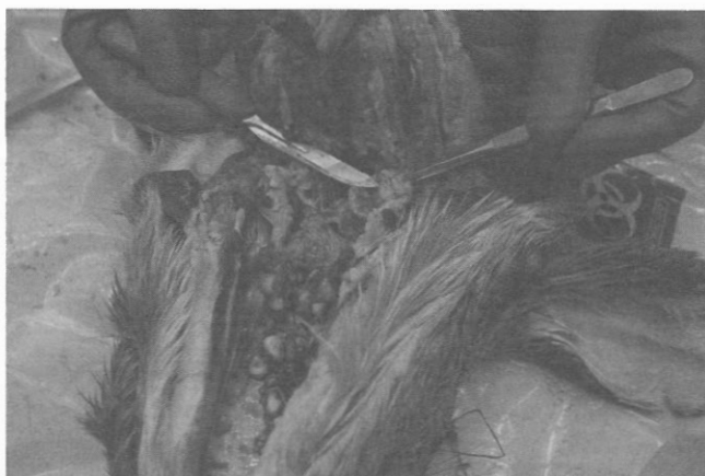
FIGURE 7.8 Inspection of white-tailed deer head for lymphoid depletion.

Although mechanisms are not completely understood, transmission of CWD occurs directly through contact with infected individuals and indirectly through contact with environments and fomites that have been contaminated by excretions of infected individuals prior to death and by their carcasses following death (e.g., Miller et al., 2004; Mathiason et al., 2006; Haley et al., 2009). Prions remain infectious in soil for over two years, suggesting that soil may serve as a reservoir for CWD prions (Seidel et al., 2007). Although interspecies transmission likely occurs within the Cervidae, CWD has not been transmitted by oral inoculation to species outside this family.