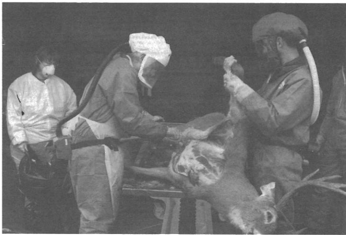
FIGURE 7.1 Personnel from the Michigan Department of Natural Resources and U.S. Department of Agriculture's Animal and Plant Health Inspection Service conducting necropsy on white-tailed deer under moderate biosecurity conditions.

Numerous diseases and parasites cause morbidity and mortality in white-tailed deer. Altered deer behavior and reproductive success have also been noted (Matschke et al., 1984). White-tailed deer management programs should consider the significance of diseases and parasites early during the planning phases and throughout program implementation. Specifically, white-tailed deer biologists and managers would benefit by familiarizing themselves with the common infections and parasitic diseases of deer, including viruses, bacteria, infectious prions, and parasites. Herein, the purpose is to provide a brief synopsis of these diseases and parasites and the chapter is organized into primary headings of: viral diseases, bacterial diseases, rickettsial diseases, CWD, and parasites. For a more detailed account of many of these infectious and parasitic agents readers should peruse Davidson et al. (1981), Samuel et al. (2001), and Williams and Barker (2001). For an easy-to-use and practical field guide for many white-tailed deer diseases and parasites, readers should see Davidson (2006). Furthermore, this chapter does not consider the morbidity and mortality factors of toxicosis, environmental contaminants, trauma, and weather-related phenomenon.