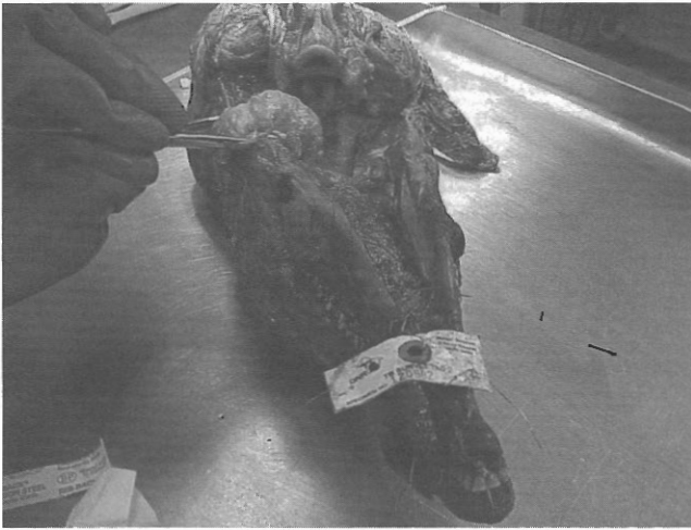
FIGURE 7.3 White-tailed deer head with swollen lymph node and abscesses.

White-tailed deer are the primary maintenance host of the disease in North America. Other wildlife species that can horizontally transmit M. bovis infection include brush-tailed possum, European badger, bison, and African buffalo (de Lisle et al., 2002). North American elk, red deer, fallow deer, Arabian oryx, dromedary camels, llamas, alpacas, and Asiatic water buffalo are other wildlife species that have been diagnosed with M. bovis (Hunter, 1996; Isaza, 2003). Additionally, coyotes can serve as sentinels for the disease in the environment (VerCauteren et al., 2008b).