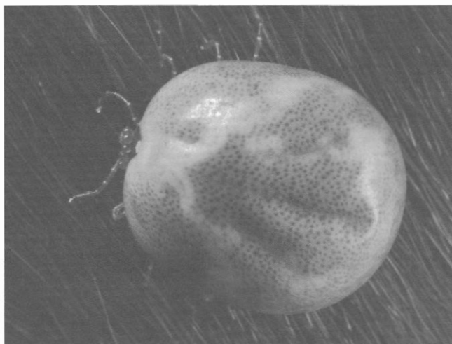
FIGURE 7.7 Dorsal view of an engorged female lone star tick. ( Amblyomma americanum)

Ticks are the natural biologic vector capable of transmitting anaplasmosis; biting insects are capable of mechanically transmitting the disease, though less efficiently (Davidson and Goff, 2001). Numerous species of ticks (including members of the genera Boophilus , Hyalomma , Amblyomma , Rhipicephalus , Dermacentor , Ixodes , Argas , and Haemophysalis ) have been shown to transmit anaplasmosis (Figure 7.7) (Kuttler, 1981). Transmission of the disease through biting insects must occur quickly in order for the infectious agent to remain viable on insect mouth parts (Davidson and Goff, 2001). Whether the disease becomes established in wild or domestic populations depends on the presence of suitable vectors in