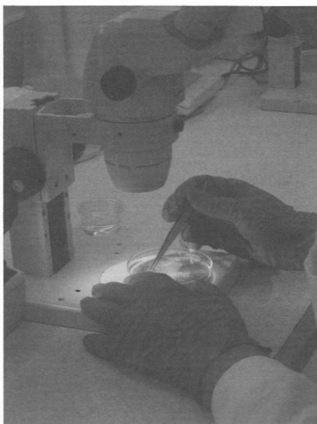
FIGURE 7.11 Personnel collecting large stomach worms ( Haemonchus contortus ) from a diluted sample of white-tailed deer fawn abomasal contents.

infestation, adult worms must be identified from the central nervous system, which requires animals to be euthanized (Carreno and Lankester, 1993; Davidson, 2006). Efforts are being made to develop molecular diagnostic tools (Gajadhar et al., 2000). The life cycle of P. tenuis is complex and involves terrestrial mollusks as intermediate hosts and deer as definitive hosts that obtain infective third-stage larvae through inadvertent consumption of mollusks (Lankester, 2001). Meningeal worms present no human health risks. However, P. tenuis is a significant threat to all native cervids in North America other than white-tailed deer (Samuel et al., 1992; Lankester, 2001). Natural resource managers and biologists undertaking cervid translocation activities should consider and take preventative measures to prevent meningeal worm introductions into susceptible herds (Davidson, 2006).