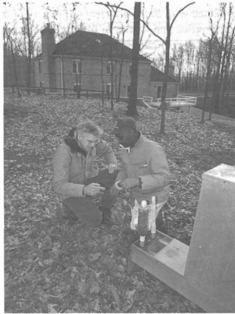
FIGURE 7.6 Biologists examining acaricide-impregnated rollers for signs of wear at a heavily used “4-Poster” in the northeastern United States.