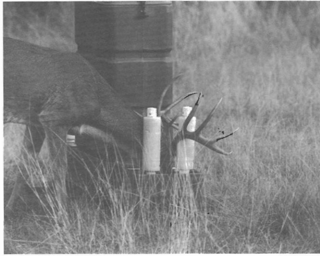
FIGURE 7.5 White-tailed deer feeding from a passive topical treatment device that applies acaricide for controlling ticks called a “4-Poster.”