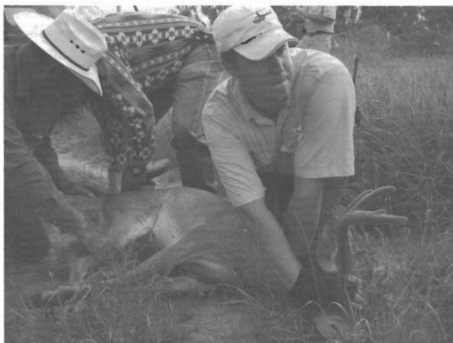
FIGURE 7.10 Inspection of wild-caught white-tailed deer for cattle fever ticks ( Rhipicephalus [ Boophilus ] spp.) that carry bovine babesiosis within the southern Texas border region.

has been found in white-tailed deer, mule deer, sika deer, fallow deer, and elk (Davidson et al., 1985; Waldrup et al., 1989a) in regions with lone star ticks, its only known vector. Diagnosis is based on identification of intraerythrocytic piroplasms (Kocan and Waldrup, 2001). T. cervi does not infect humans and poses a minimal threat to white-tailed deer populations.