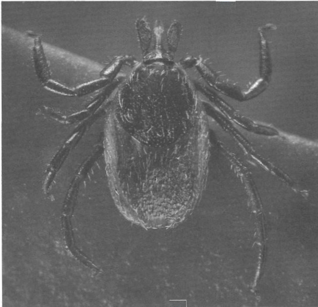
FIGURE 7.13 Dorsal view of an adult female western black-legged tick ( Ixodes pacificus ).

found in mule deer, domestic rabbits, and goats (Davidson, 2006). Infestations by ear mites are diagnosed through acquisition and identification of P. cuniculi from ears (Davidson, 2006). Ear mites mature from eggs, to larvae, to adults on white-tailed deer, with transmission from deer-to-deer via direct contact (Scott et al., 2000). Ear mites pose no human health risks and are not considered overtly pathogenic to white-tailed deer unless heavily infested (Davidson, 2006).