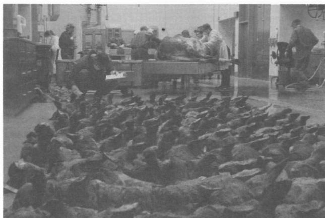
FIGURE 7.9 White-tailed deer heads waiting evaluation and testing during active surveillance activities for CWD.

The presence of CWD in captive and free-ranging populations of white-tailed deer and other cervids is a serious management problem. There is no known treatment for animals affected with CWD, and it is considered 100% fatal once clinical signs develop. Eradication from free-ranging deer is unlikely due to CWD's long incubation period, subtle early clinical signs, extremely resistant infectious agent, environmental contamination, and multiple modes of transmission (e.g., Williams and Miller, 2002; Spraker, 2003; Sigurdson, 2008). Active surveillance aids in determining the distribution and prevalence of CWD and can be used to elucidate changes over time (Figure 7.9). Localized population reduction, regulating translocation of deer, and banning baiting and feeding have all been attempted to slow down the spread of CWD.