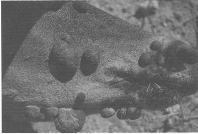
FIGURE 7.2 Cutaneous fibromas on a white-tailed deer.

There are >125 papillomaviruses that infect >50 mammalian species, including six that have been found on Cervidae (Sundberg et al., 1997).