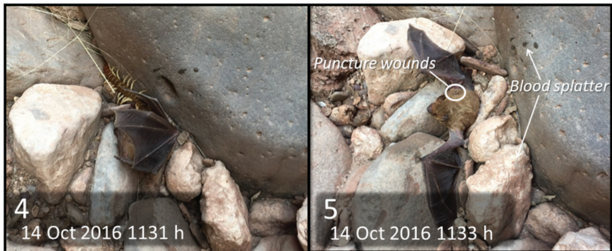
Figures 4–5. Photographs of centipede predation in Texas. 4) Uncoiling of Scolopendra heros from E. fuscus . 5) Injured bat after S. heros had retreated.