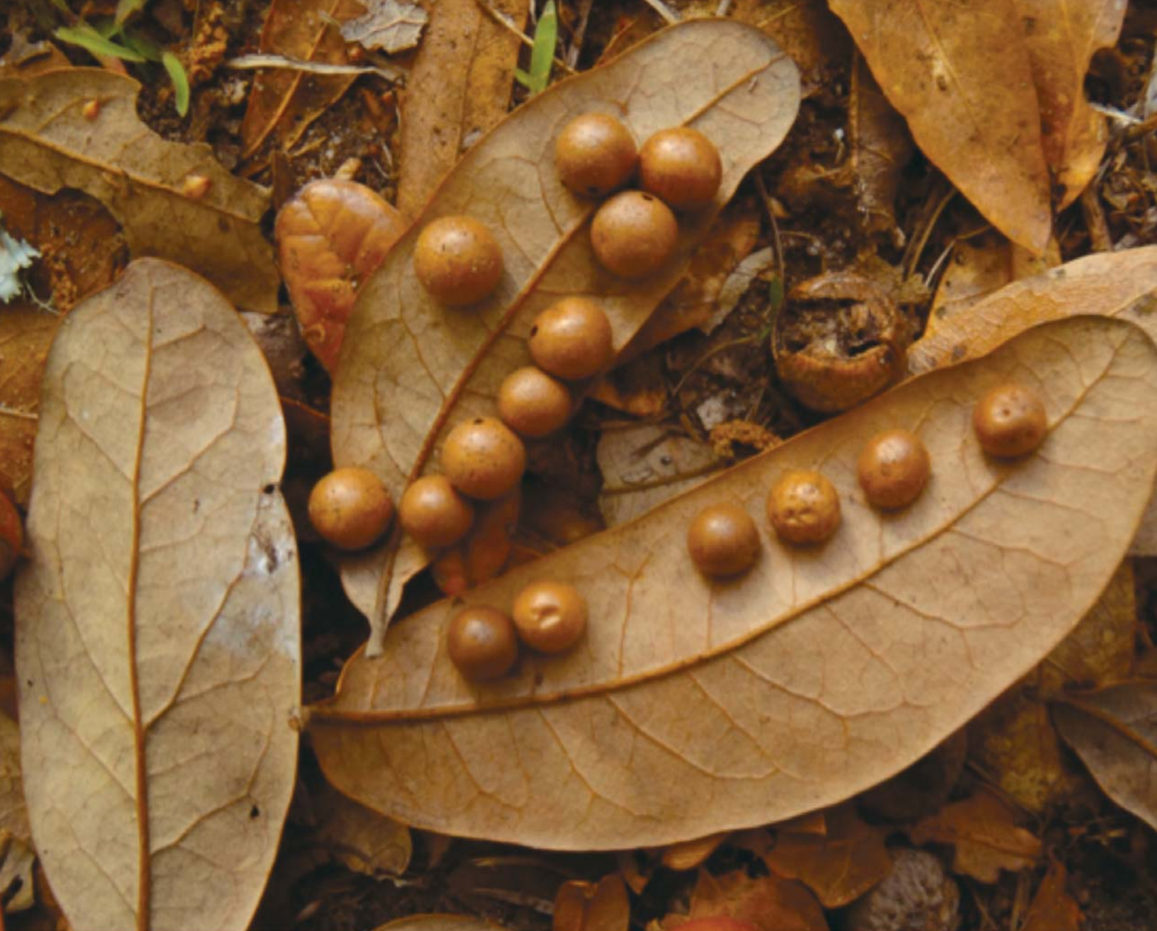
Pea galls on live oak leaves ( Quercus virginiana ) induced by Belonocnema treatae , a gall wasp.