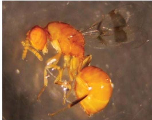
Microwasp parasitoids of pea gall wasp larvae. Left to right: Synergus sp. and Ormyrus sp.