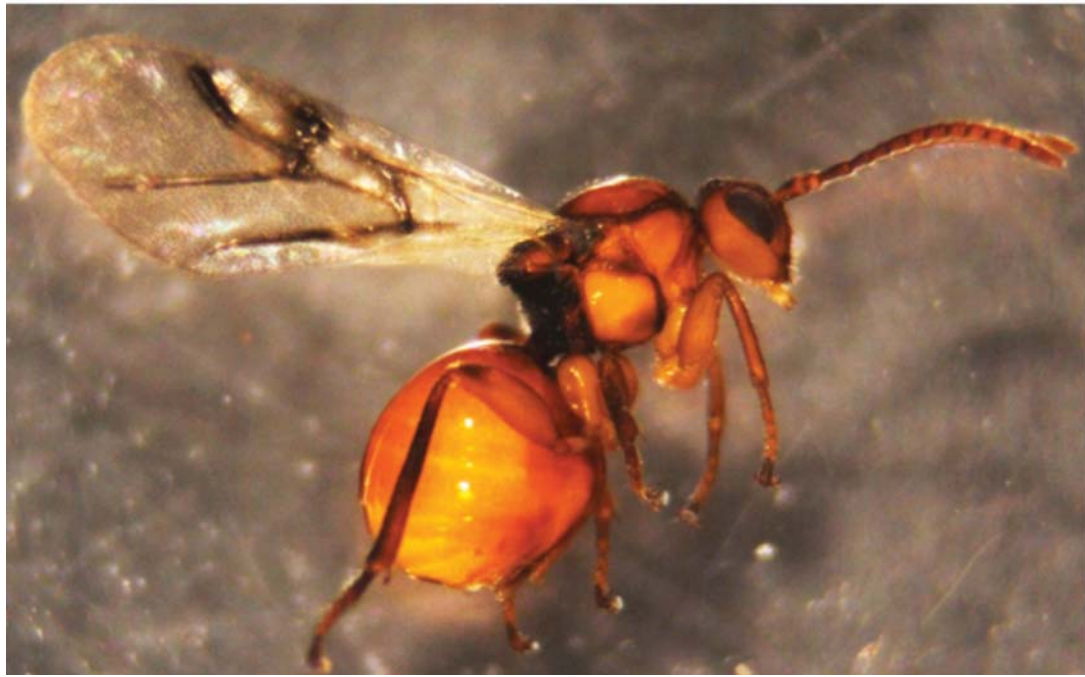
Belonocnema treatae , live oak pea galler wasp (3 mm long).

Maybe you have noticed these little spheres before – but did not give them much thought. Or maybe, you puzzled: What are these wooden pearls? How did they get there? Well, a tiny wasp, called the pea galler wasp or gallfly, Belonocnema treatae , is the culprit. The diminutive female gallfly (one of nearly a thousand species in the gall wasp family Cynipidae), about the size of a fire ant, lays eggs on a freshly budded live oak leaf in spring. When the larva hatches, it produces a chemical that induces the oak to enclose it in a protective and nurturing gall: nifty chemical subterfuge, producing a durable little house for the gall wasp larva – no house of bricks, but nearly as good – indeed maybe even better. It comes equipped with a food supply as well. At the chemical direction of the larva, the gall provides an inner layer of nitrogen-rich pulp, similar to seed tissue. A tough lignin-rich 1 outer layer protects the larva from predators, and a chemical shield of anti-microbial tannic acid is concentrated within. Tannic (or gallotannic) acid concentrated in the gall is the tree’s way of isolating the parasitic larva. Ironically, however, the same phenol-rich barrier helps deter predators and disease. Perhaps the bitter taste of tannins and phenols may also discourage predation of gall larvae by birds.