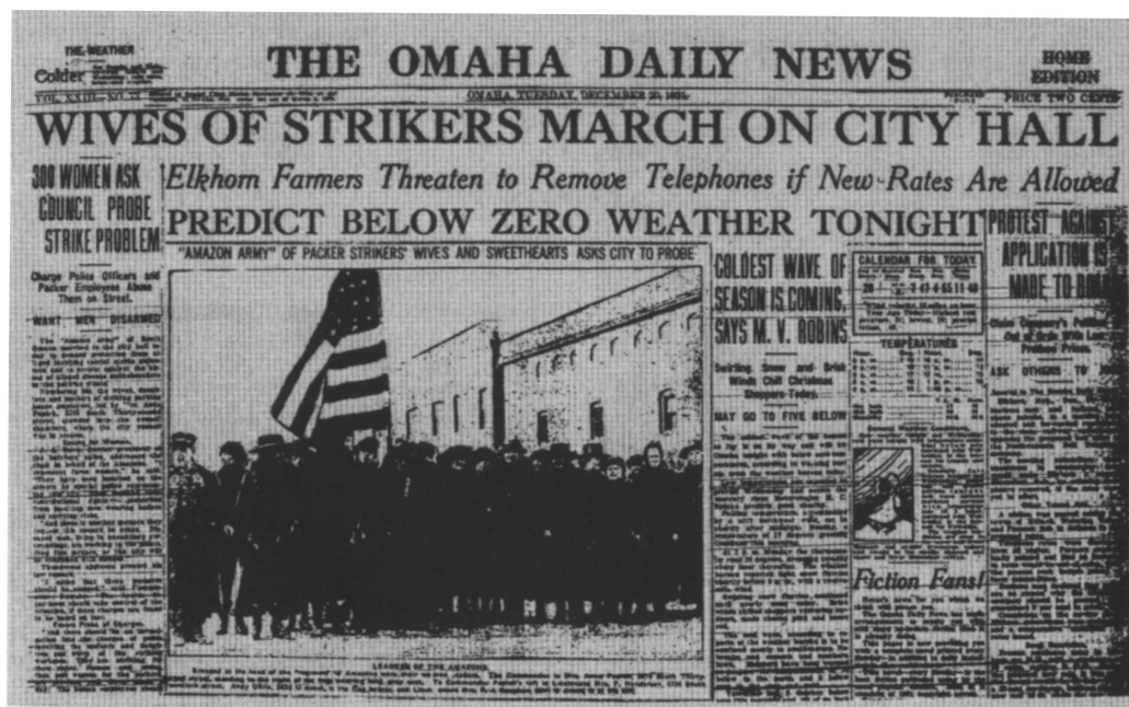
FIG. 9. Newspaper report about the "Amazon Army," three hundred Omaha women who marched on the Omaha City Hall building to protest abuses by the packers and police during the strike. The "Army" consisted mainly of relatives of strikers rather than strikers themselves. Omaha Daily News, 20 December 1921.

Women also took part in the later packing union efforts. During the late 1930s, a husband-and-wife team was quite active in the Armour's local in Omaha, and later some women served as officers of other UPWA locals. 54 In 1942, the union helped pressure Armour to hire black women in the plant, and efforts were made to establish equal pay for equal work. This was a difficult issue internally within the UPWA, and I do not want to suggest that it was handled to everyone's satisfaction. It was not. 55 Later, in the early 1970s, a woman was elected president of Local 62, the bargaining agent for Wilson employees. 56