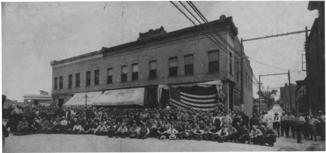
FIG. 1. Railroad strikers in McCook, Nebraska in 1922.

the Southwest or the Pacific Northwest, the northern Plains has lagged behind in the study of labor history, and a great deal of work remains to be done. 6 Perhaps it is time to make an assessment of the research that has been completed and, more important, to suggest possible areas for new research. My focus is upon labor unions and labor-management relations, and this essay examines topics related to those approaches that could be pursued in the future. But I stress at the outset that it is not presented as a comprehensive survey of labor history topics that need to be studied and that other subjects and approaches should be explored as well. 7