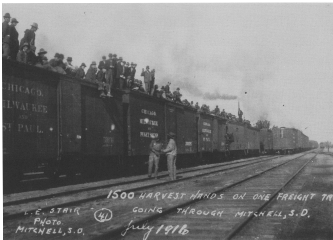
FIG. 4. Fifteen hundred hands on one freight train going through Mitchell, South Dakota, July 1916.

it has involved class warfare in the late nineteenth and early twentieth centuries. Historically, thousands of miners have worked in North and South Dakota mines. The Homestake gold mine in the Black Hills is the best known, but there were a number of independently operated facilities nearby. In North Dakota there are substantial deposits of lignite coal in the central and northwestern part of the state. At one time, the Western Federation of Miners represented Homestake miners. In 1909-10, however, the company locked its workers out and broke the union. 25 It was a bitter struggle, and the labor movement never was reconciled to this defeat. Repeated efforts have been undertaken to unionize the workers. During World War II, an attempt was made to organize them into an AFL federal union.