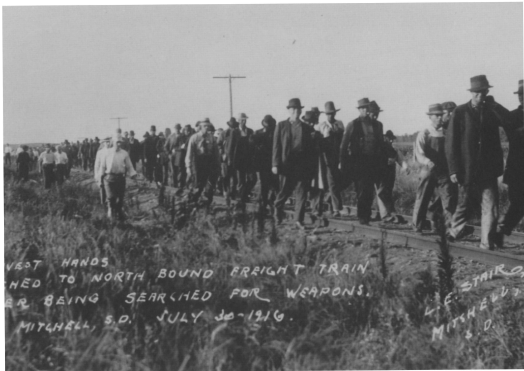
FIG. 6. Harvest hands marched to north bound freight train after being searched for weapons, Mitchell, South Dakota, 30 July 1916.

Wobblies and the community's response to them would be informative. I also wonder what the possibilities might be for tracing the later careers of former IWW members in the region. Some sons of farmers became harvest hands and joined the "one big union." A former South Dakota Communist leader told me that two of his brothers, who were raised on a farm near Bristol, South Dakota, were IWW members prior to enlisting in the CP in the 1930s. 30