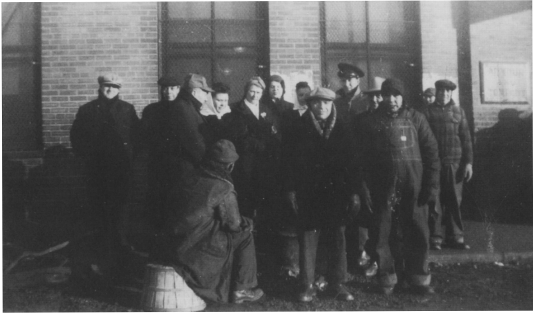
FIG. 2. Striking Omaha Packinghouse Workers in 1948.

in Dakota City, Grand Island, and now Lexington, Nebraska.