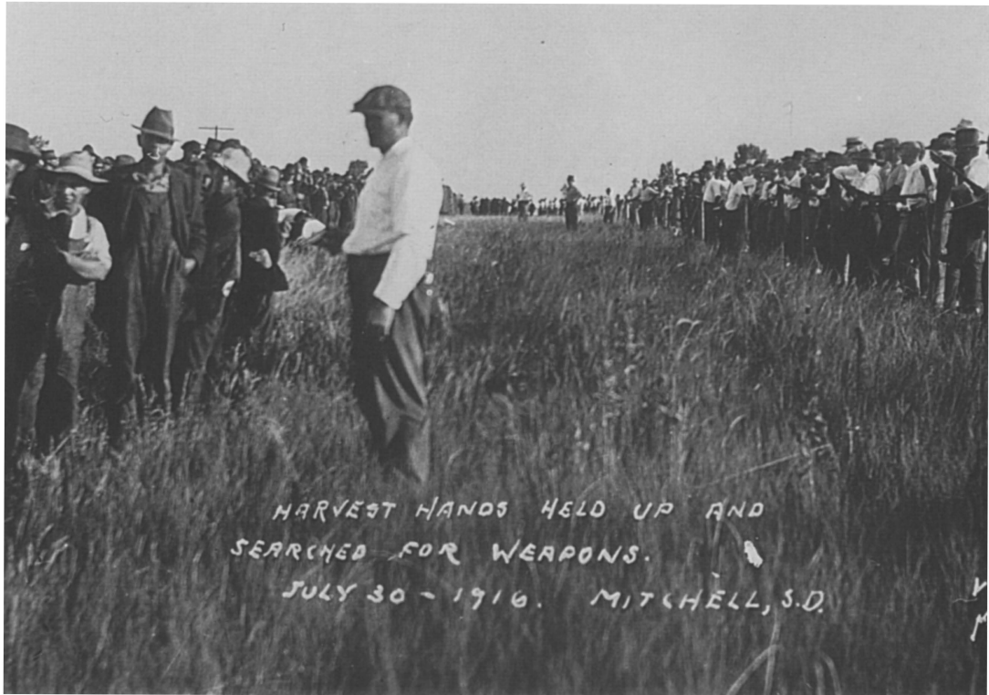
FIG. 5. Part of the "great fear," harvest hands held up and searched for weapons, Mitchell, South Dakota, 30 July 1916.

IWW had a following in all three states; Lawrence County, South Dakota, the site of the Homestake, provided the Socialist Party with its strongest vote prior to the 1910 defeat; Communists helped organize Omaha packinghouse workers in the 1930s; and a North Dakota AFL leader was a long-time member of the Communist Party (CP). 27 (See Fig. 3)