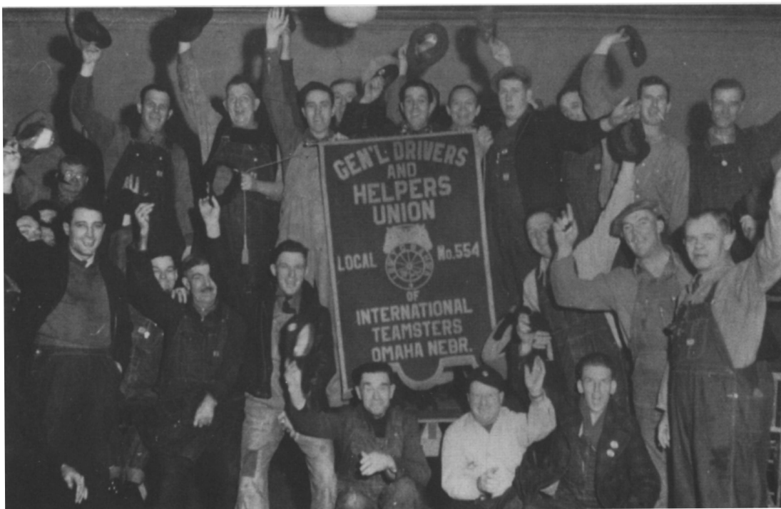
FIG. 8. Omaha Teamsters celebrating after winning a long strike in 1939.

of 1903 and orchestrated local employer responses to union demands that year and later. After a 1903 lock-out, many local businesses opted for the open shop. A 1909 union defeat on the street railway reinforced employer opposition to unions. 38 But not until the World War I era did the local labor movement again seize the initiative, only to suffer a series of postwar defeats that reestablished the open shop at most work sites. By the 1930s the Business Men's Association asserted: "Omaha is the best open shop city of its size in the United States." Omaha employers remained in the driver's seat well into the Depression decade. Unionization drives and New Deal policies, however, led to major changes in local labor-management relations. Among the biggest changes were those in the trucking and pack-