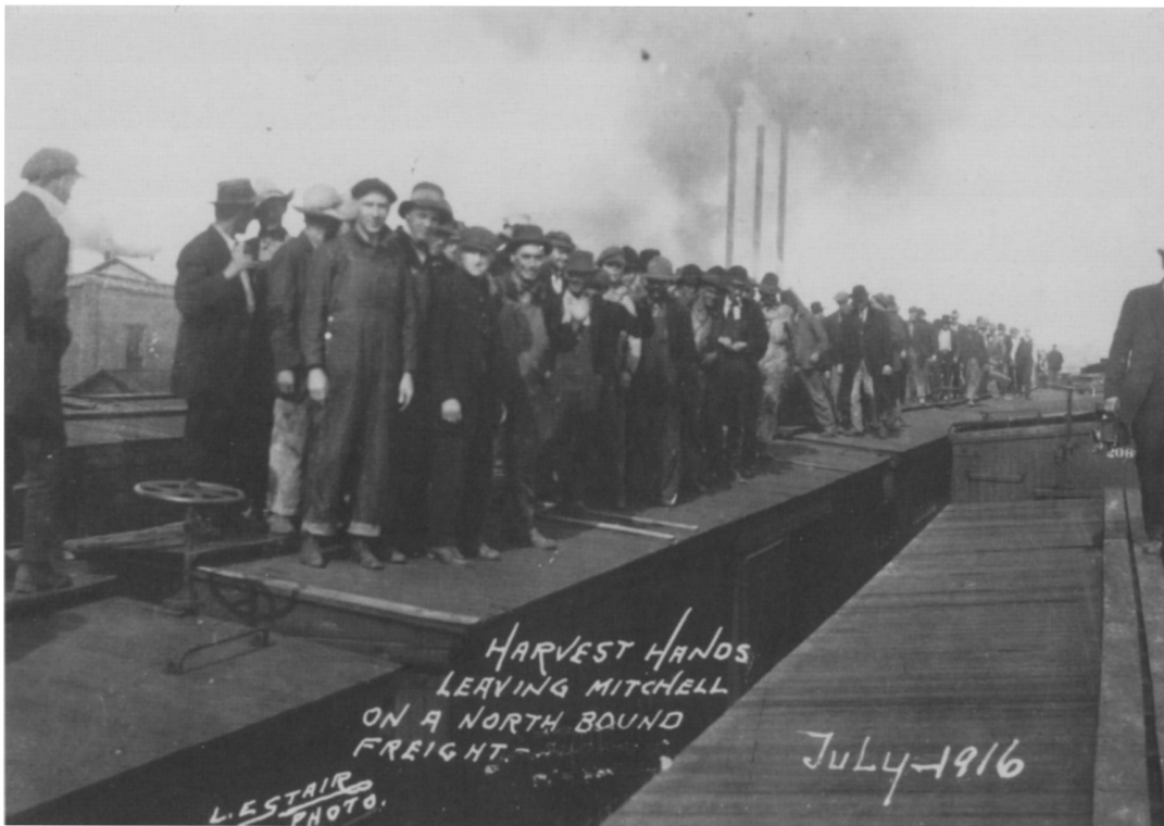
FIG. 7. Harvest hands leaving Mitchell on a north bound freight, Mitchell, South Dakota, July 1916.

question worth posing: What was the significance of the earlier left-wing experience that many unionists either passed through or witnessed?