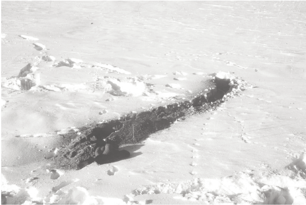
Fig. 1. A 1.8-m-long deposit of soil (digging) left by a black-footed ferret ( Mustela nigripes ) on white-tailed prairie dog ( Cynomys leucurus ) habitat near Meeteetse, Wyoming. The larger twin prints are tracks of the ferret.

left by ferrets (Fig. 1) occupying colonies of black-tailed prairie dogs ( Cynomys ludovicianus ; Hillman 1968, Henderson et al. 1969, Fortenberry 1972) and habitat of white-tailed prairie dogs ( Cynomys leucurus ; Clark et al. 1984, 1986, Richardson et al. 1987, Clark 1989). The latter authors have implied, from circumstantial evidence on seasonal disappearance and reappearance of white-tailed prairie dogs, that black-footed ferrets (ferrets henceforth) dig at prairie dog burrows in winter to excavate hibernating prairie dogs that have plugged portions of tunnels. Others (Eads et al. 2012) have noted that digging by ferrets is common in summer, although abundant prairie dog activity can quickly render the soil deposits unrecognizable.