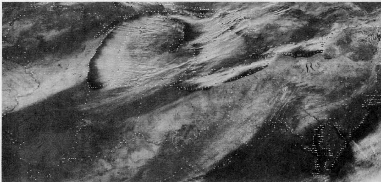
FIG. 1. Satellite photograph of 30 November 1976 illustrating the bands of lake-induced clouds streaming inland to the lee of the Great Lakes.

product and to illustrate how well it performed during two independent snowfall seasons (1976–77 and 1977–78).