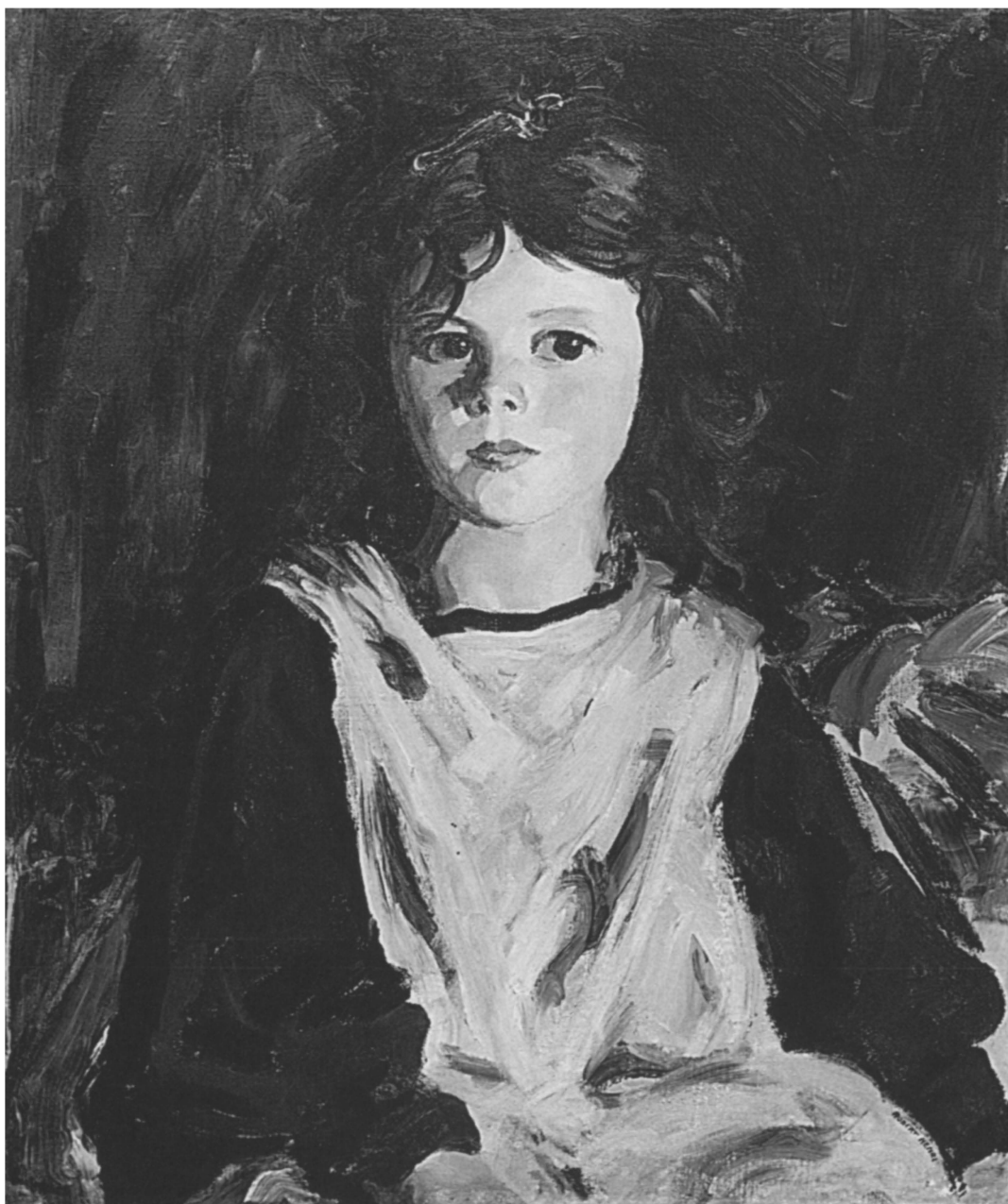
FIG. 3. Robert Henri, 1865-1929, The Pink Pinafore , 1926, oil on canvas, 24 in. x 20 in. Courtesy of Sheldon Memorial Art Gallery, University of Nebraska-Lincoln, F. M. Hall Collection.