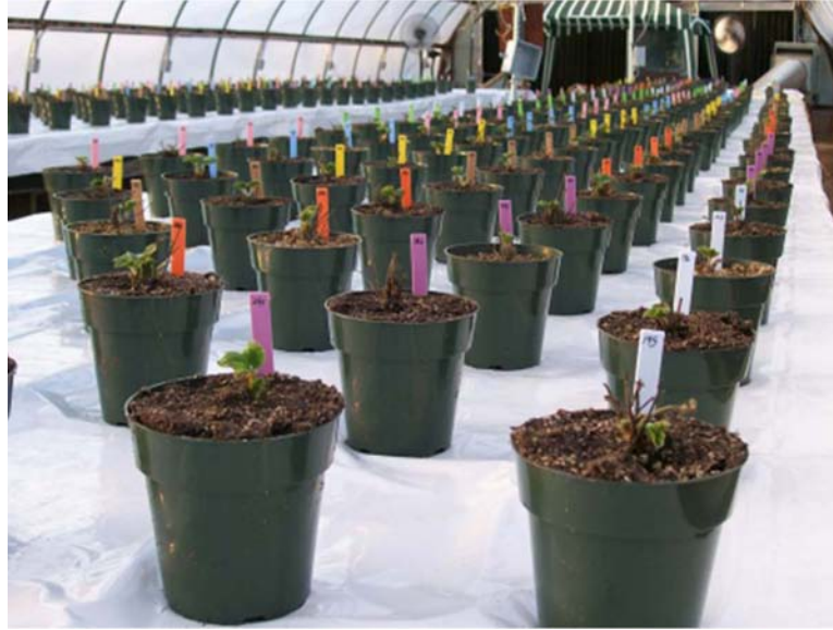
Fig. 1. Experimental layout for 13 strawberry cultivars. Each plant of each cultivar is represented by an unique number and tag color.

6 replications of four plants for each cultivar (the four plants/pots comprise the experimental unit), with 3 replications running north-south on each bench ( Fig. 1 ).