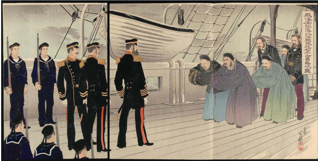
Figure 3. Migita Toshihide. Admiral Ding Ruchang Surrenders . 1895. Museum of Fine Arts-Boston. Note the wholly westernized clothing of the Japanese military and diplomatic representatives.

quite the diplomatic dance around the cotton trade: Japan purchased most of its raw cotton from the British Empire and the United States, contributing to the success of their agricultural interests, while simultaneously competing with those nations' manufacturing interests. 7 In the 1930s, however, a need for foreign currency to support purchases of the materials necessary for the war with China led Japan to begin exporting woolen textiles, as well as cotton.