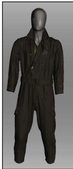
Figure 4. Still composite of the scan of the Japanese Airman's suit. To see in 3D, click on URL. Password: Suit. Click on hotspot 1 to see close up of hole. Click on Hotspot 2 to see the internal label

https://sketchfab.com/3d-models/wwii-airmans-suit-a3aceab5d8314bd28a0e864d2cc24606