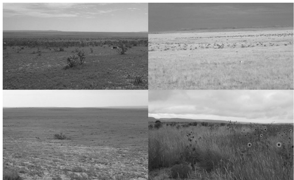
Fig. 2 Examples of the landscape variability within the study area in southeastern Colorado, USA. Clockwise from the upper left: private ranchlands, USFS Comanche National Grassland, non-training area on the PCMS, and mechanized infantry training area on the PCMS

We evaluated the relationship between structural vegetative characteristics and small mammal community indices (diversity, richness, total biomass, and per capita biomass) using stepwise regression (SAS version 8). Correlations between vegetation variables were evaluated with Pearson correlation coefficients and highly correlated variables were