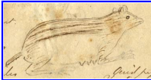
Figure 7. “White-striped lemming”, Lemmus albovittatus (no. 192). “Fallow, with 5 white longitudinal stripes, the middle one extending over the head to the nose, tail truncate, one-sixth of total length. Length 4 inches. A most interesting small animal; vulgar name, nursing mouse. The female carries her young on her back, she has 6 pectoral teats; she lives on corn, seeds, &c” (Rafinesque 1818b: 446). Formally described as L. albovittatus , Rafinesque (1818b: 106; 1820a: 3) subsequently referred to it as L. vittatus . Original image 57 × 29 mm.

All images pen-over-pencil sketches from Rafinesque's field notebook 17. Images (SIA2012-6095, -6096, -6099)