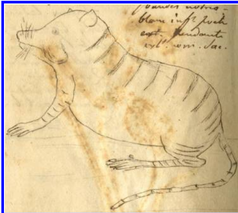
Figure 4. “Brindled stamiter”, Cricetus fasciatus (no. 193). “Body fallow, brindled, with black on the back, white underneath, legs and tail ringed of black, tail two-fifths of total length, ears oval, acute, pouches hanging outside as bags. Length 8 inches. It burrows in the barrens” (Rafinesque 1818b: 446). Rafinesque (1820a: 3) provided a more detailed description: “Rufous, with about ten transversal black streaks over the back, legs with some similar streaks; tail rather shorter than the body, slender and with black ring: pouches external, flaccid. – This is the Hamster of the barrens of Kentucky and the western states; it has a thick body, the head like a dog, small eyes and ears, these oval and acute, the forehead rounded and the pouches hanging like bags.” Original image 78 × 68 mm.

All images pen-over-pencil sketches from Rafinesque’s field notebook 17.