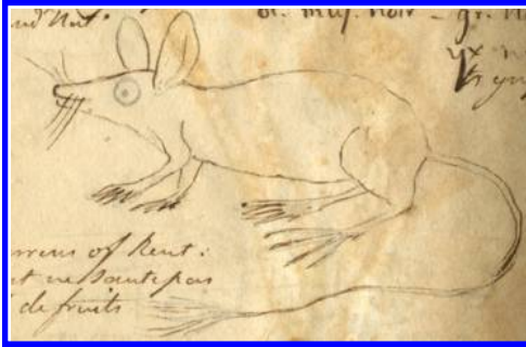
Figure 1. “Big-eye jumping mouse”, Gerbillus megalops (Rafinesque’s field notebook, no. 187). “Body gray, belly white, eyes black, very large, ears very long, white inside, snout black, tail longer than the body, black with a white tuft at the end. Total length 5 inches, body only 2 inches, in the barrens of Kentucky, &c” (Rafinesque 1818b: 446). Rafinesque (1820a: 3) added: “. . . it feeds on seeds and fruits; total length six inches, of which the tail composes more than half.” Original image 70 × 48 mm.