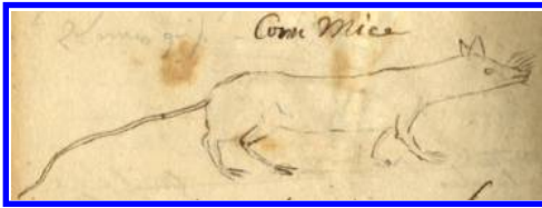
Figure 5. “Black-eared shrew,” Sorex melanotis (no. 194). “Body pale gray, white beneath, ears erect, black outside, white inside, neck and body elongated, tail nearly as long, gray. Length 5 inches. Vulgar name, corn mice” (Rafinesque 1818b: 446). Original image 83 × 24 mm.