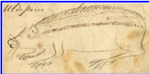
Figure 3. “Three-striped mole rat”, Spalax trivittata (no. 186). “Body fallow, with 3 large brown stripes above, white underneath, ears small, acute. Length 7 inches without any tail. In the woods, near brooks, &c” (Rafinesque 1818b: 446). Rafinesque (1820a: 3) redescribed this as Spalax vittata , adding “it burrows like a mole and feeds on snails, slugs, earthworms, &c. It has almost the shape of a pig, but the snout is rounded and with small whiskers.” This is the only species of mammal for which Rafinesque (1832) acknowledged Audubon as the source. Original image 57 × 27 mm.