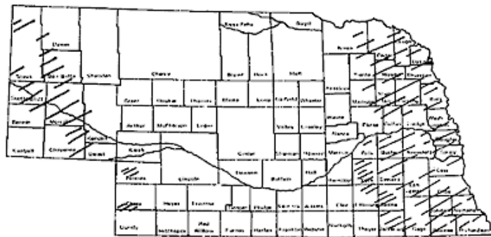
Map 1. Some known areas of confined aquifer in Nebraska.

One of the major confining layers in Nebraska is glacial till. Extensive glacial till deposits are found in the eastern part of Nebraska ( Map 1 ). Confining layers of clay and silt are found throughout Nebraska. Some confining layers are found where the bedrock has been tightly cemented, such as in the Ogallala formation. Confining layers may be encountered in many areas of Nebraska.