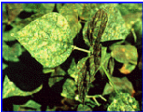
Figure 1. Severely infected bean plants (24K JPG).

Rust symptoms initially appear as small yellow or white slightly raised spots on upper and/or lower leaf surfaces ( Figure 1 ). These spots enlarge and form reddish-brown or rust-colored pustules called uredinia, which are about 1/8 inch or smaller and contain thousands of microscopic summer spores called urediniospores ( Figure 2 ). Pustules may be surrounded by a yellow border. Spores (fungus seeds) are readily released from the pustule to give a rusty appearance to anything they contact. Rust can be distinguished from other leaf spots because the rust-colored spores will rub off, while with blights and bronzing, nothing rubs off.