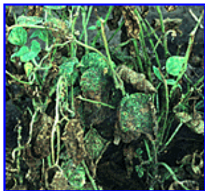
Figure 3. Severely infected bean plants (56K JPG).

white, red kidney and black beans. However, seed availability of rust-resistant pinto and great northern varieties may be limited. Also some rust-resistant varieties may be susceptible to other disease and insect pests.