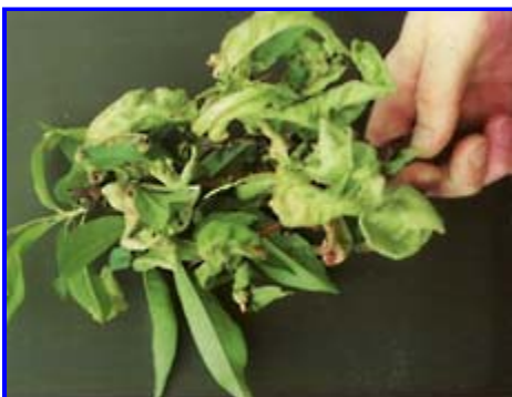
Figure 1. Severe peach leaf curl symptoms on peach.

Peach leaf curl, caused by the fungus Taphrina deformans , is easy to recognize. The most characteristic symptom is the curling and crinkling of the leaves as they unfold in spring ( Figure 1 ). Usually, the entire leaf is affected, but sometimes only small areas are involved. In addition to the curling, diseased leaves are thickened and often turn red or purple.