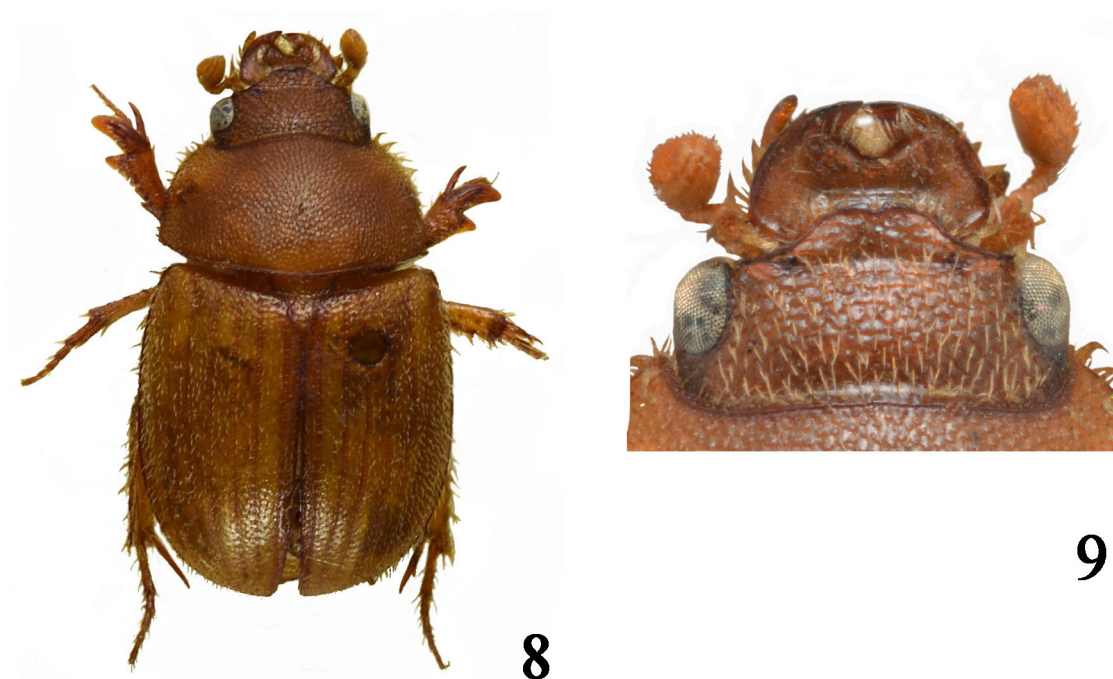
Figures 8–9. Ochodaeus cychramoides Reitter, 1892, syntype. 8) Habitus. 9) Head.

Italian distribution. Piedmont (Reitter 1892, as Ochodaeus cychramoides ); Trentino (Halbherr 1892); Lombardy, Veneto, Abruzzo, Lazio, Campania, Sardinia, Emilia (as O. cychramoides ), Calabria (as O. cychramoides ) (Luigioni 1929); Romagna (Zangheri 1969, as O. cychramoides ; Melloni and Landi 1997); South Tyrol (Peez and Kahlen 1977); Basilicata (Angelini and Montemurro 1986); Apulia (Aliquò 1990, as O. cychramoides ); Umbria (Melloni and Landi 1997).