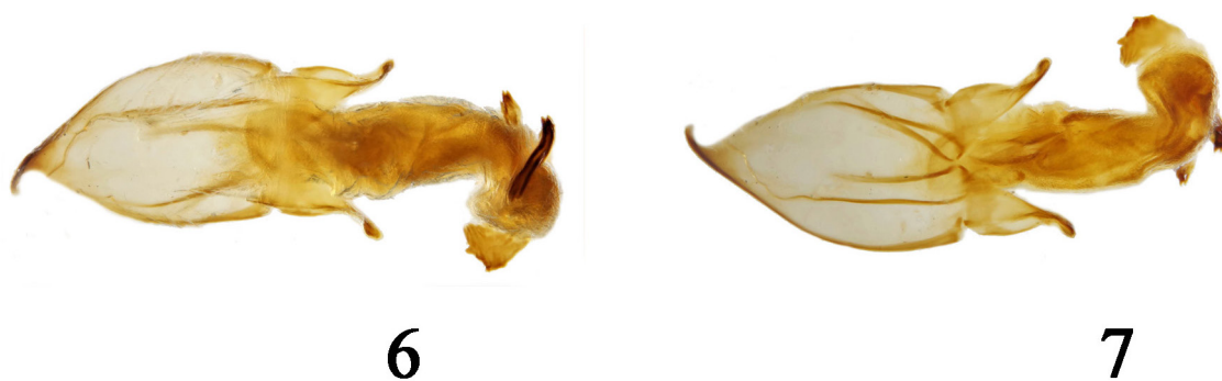
Figures 6–7. Ochodaeus chrysomeloides (Schrank, 1781), aedeagus of the neotype. 6) Dorsal view. 7) Ventral view.