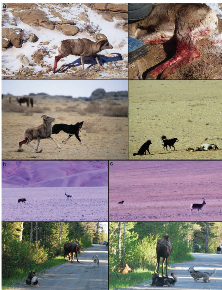
Figure 2. Free-roaming dogs (a) attack and kill argali in Mongolia, interact with (b) endangered chiru and (c) Tibetan gazelle in Tibet, and (d) harass a female moose with calves in Alaska.

Argali. Argali in Ikh Nart Nature Reserve, Dornogobi Aimag, were captured and radio-collared between 2002 and 2007 (Reading et al. 2003, 2005, Kenny et al. 2008). Collared argali were tracked for a minimum of two weeks each month and survival was monitored daily with binoculars and telemetry. All collars were equipped with mortality sensors. When an individual animal was found dead, a necropsy was performed to determine the cause of death and the surrounding area was searched for additional clues. In cases of predation, attempts were made to identify the predator species. Potential predators of argali include wolves, free-roaming dogs, foxes ( Vulpes vulpes and Vulpes corsac ), and snow leopards ( Uncia uncia ). Fox and snow leopard kills could normally be distinguished from those of other predators by