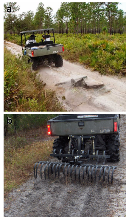
Fig. 2 Preparation of tracking plots using a drag device ( left photo ) and mechanical rake ( right photo ) to smooth the track plot surface

sporadically released to be hunted. Such releases represent an artificially increased prospect for immigration to the base beyond what would occur naturally among the feral swine living in the vicinity. We used seven tracking plots near the northern border to see if their index values were higher relative to trends observed for the base as a whole, which might indicate an immigration pulse from the neighboring property