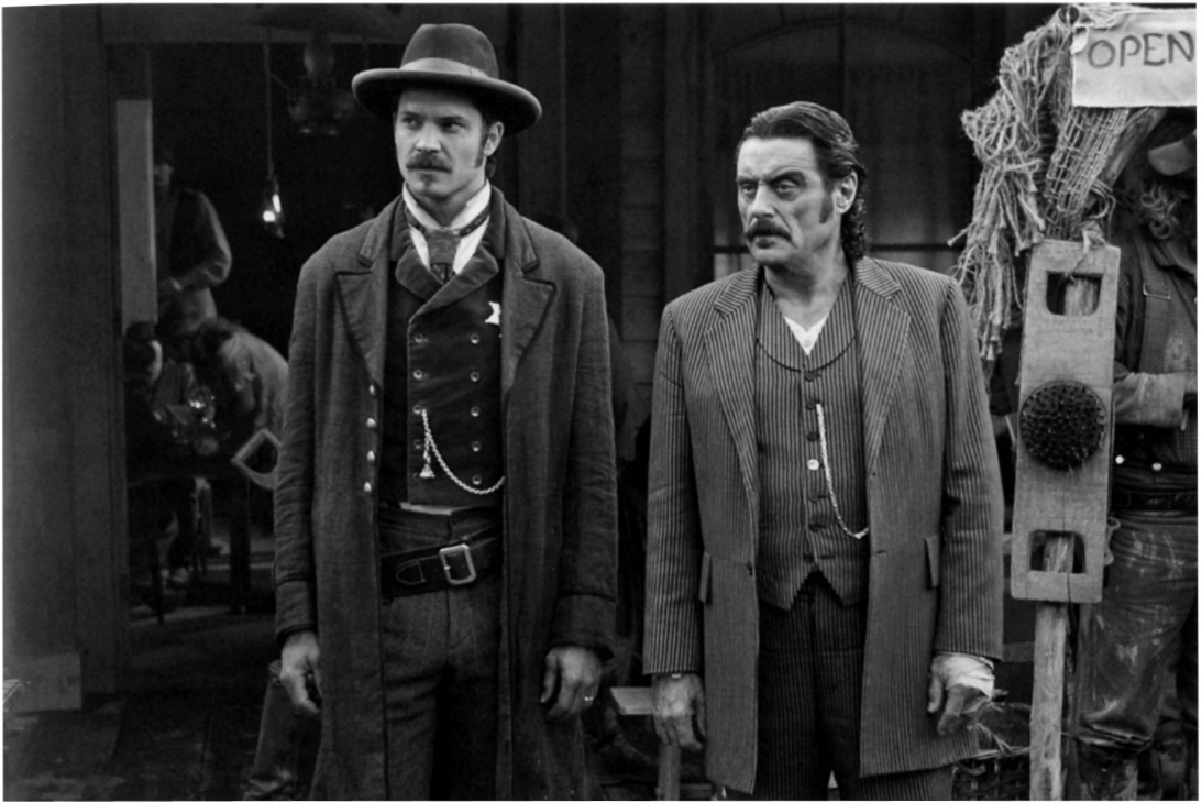
FIG. 2. Seth Bullock (Timothy Olyphant), Sheriff of Deadwood, with Al Swearengen (Ian McShane), owner of the Gem Saloon. From Deadwood, season 3, episode 30, "A Rich Find." Courtesy of Home Box Office, Inc. (HBO).

the result of Swearengen's actions, not one made by the municipal organization. Swearengen calms Bullock by stating that it is a "ceremonial position" to comfort Nuttall, but Bullock notes Stapleton "ain't right for the camp" and that he will not make the camp safe for women and children (Bullock has made plans to bring his wife and child to Deadwood). He sums up, "That job shouldn't go to a shitheel," to which Swearengen retorts, "Oh, where my feelings would be it should go to a shitheel as it's shitheel work." After Bullock answers, "It doesn't have to be," Swearengen half-mockingly says, "No? Mr. Bullock, would you sit down a second? I want to tell you something about the law. Please."