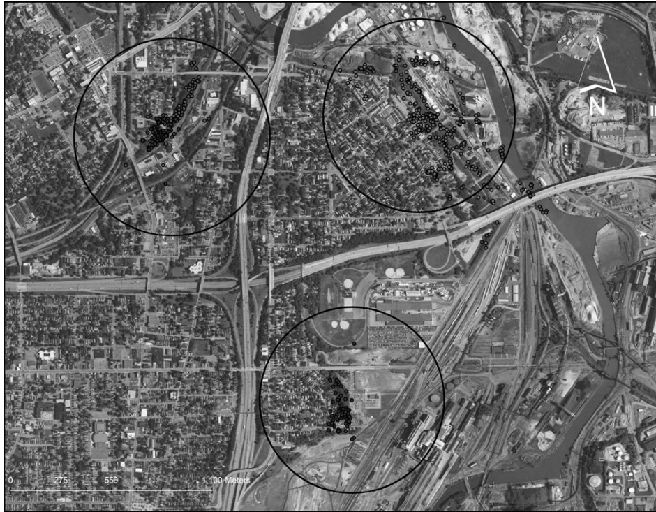
Figure 1. Representative urban study sites (with raccoon [ Procyon lotor ] locations), Cleveland, Ohio, USA, May 2009 to March 2010.