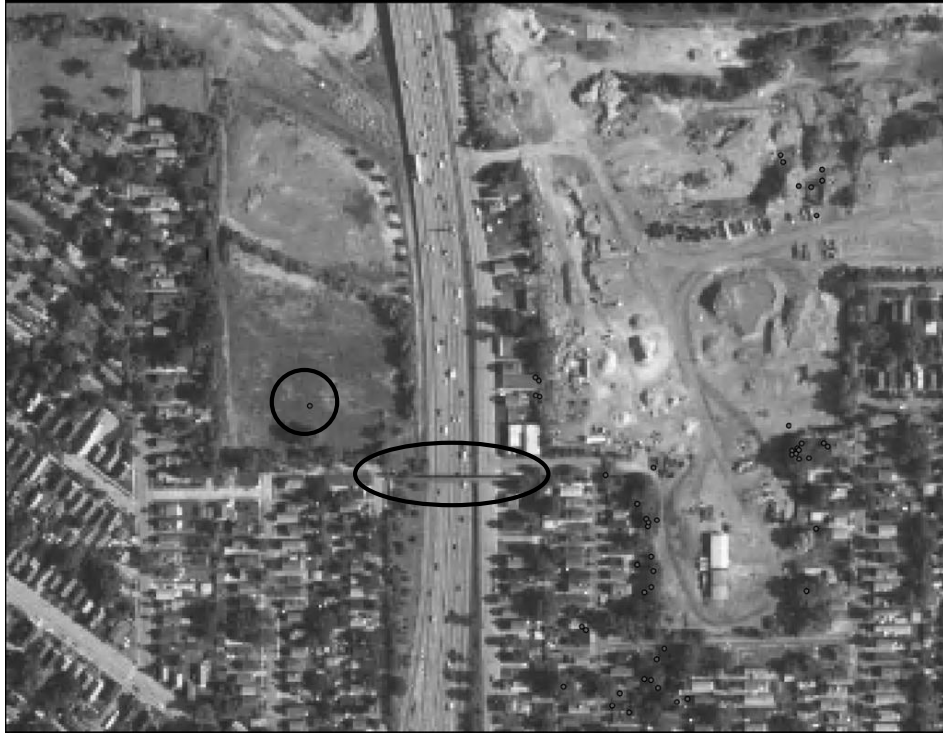
Figure 2. Raccoon ( Procyon lotor ) location across an interstate highway, showing pedestrian crossing bridge, Cleveland, Ohio, USA, May 2009 to March 2010.